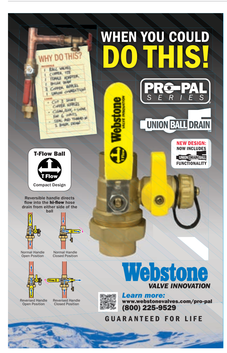
• Circle 3 on reader reply form on page 85