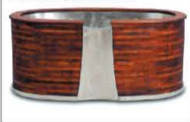
Diamond Spas Oasis Tub

seating arrangements. The custom Oasis Tub is one of Diamond Spas most elegant baths to date. Layers of rich mahogany are split front and center to allow for a unique overflow panel. With a deep and spacious interior bathing and benches for two, this classy bath brings organic elements and modern finishes together in harmony. Diamond Spas recently opened a suite in the Design Resource Center of Chicago's prestigious LuxeHome, one of the country's premier destinations for fine kitchen, bath and building products.