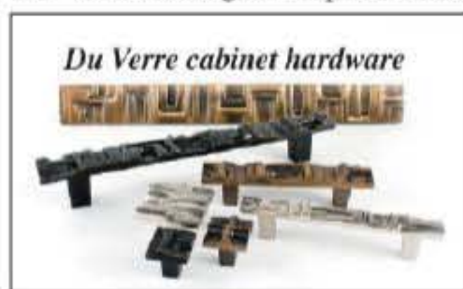
Du Verre cabinet hardware

Earthy textures lay a new foundation for warmth and coziness in the home. Think of trying textures in unusual places, such as hardware on a piece of furniture or hanging knobs on the wall for a quick towel holder. Du Verre's designer-inspired lines