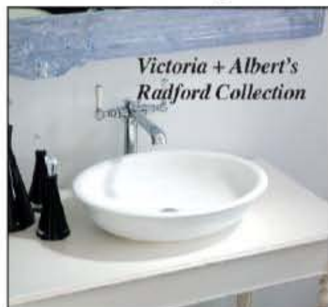
Victoria + Albert's Radford Collection

comeback, such as Victoria + Albert's new Radford Collection. Taking inspiration from the Victorian period, but with a touch of modern day refinement, the new tub has an opulent roll-top and a complementary basin. This beautiful collection introduces a touch of traditional elegance to the