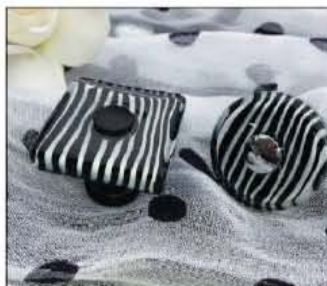
Atlas Homewares Dream Glass zebra print knobs

From clothing inserts and accessories to carefully chosen accents for the home, the animal-inspired look is making an encore. A timely new addition to the Atlas Homewares Dream