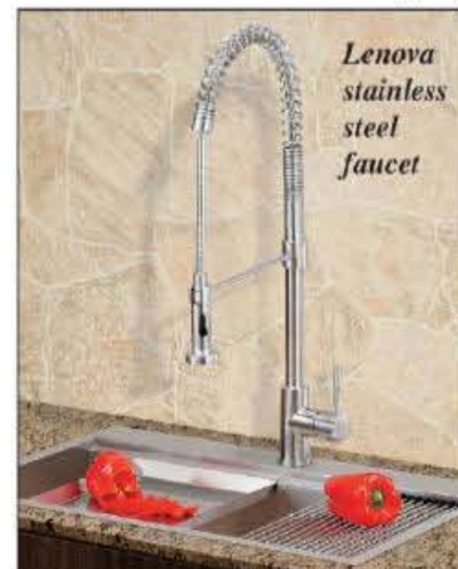
Lenova stainless steel faucet

line of faucets at KBIS 2013. The new line includes a variety of models (Turn to Decorative... page 154.)