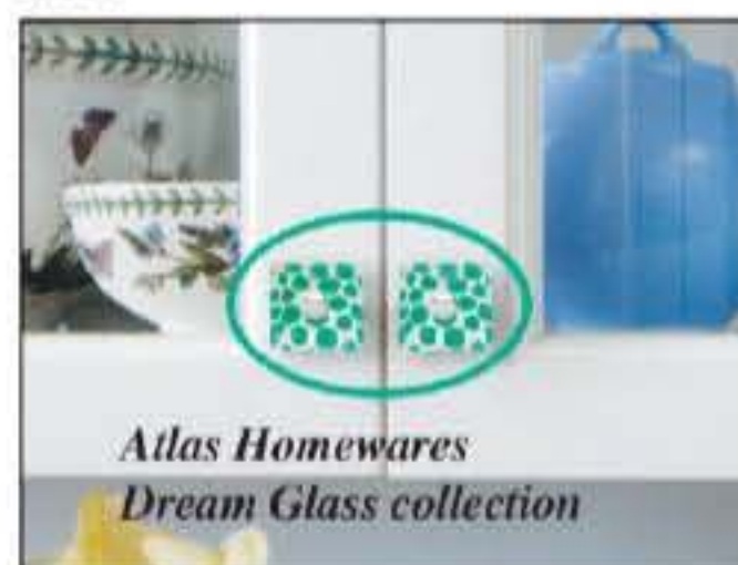
Atlas Homewares Dream Glass collection

Perhaps the most significant takeaway from this year's top trends is "creating a harmonious whole." This is done through the successful marriage of color, texture, technology, functionality and style that can actually aid in invoking a sense of balance.