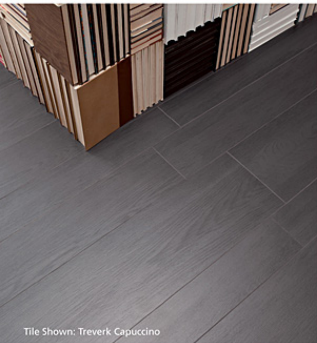
Tile Shown: Treverk Capuccino