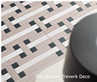
Tile Shown: Treverk Deco

Treverk | Color Body Porcelain Stoneware