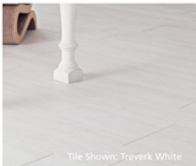
Tile Shown: Treverk White