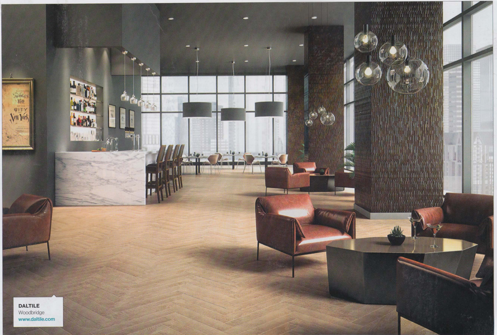
DALTILE Woodbridge www.daltile.com