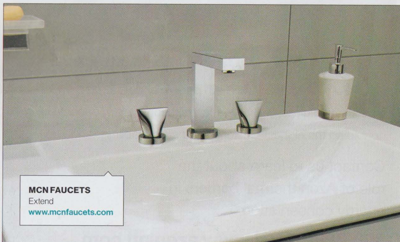
MCN FAUCETS Extend www.mcnfaucets.com