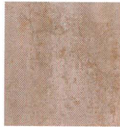
FLOOR TILE Ferroker Aluminio porcelain tile | $6.95 per square foot Porcelanosa porcelanosa-usa.com