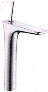
FAUCET PuraVida 240 Single-Hole Faucet in chrome | $682 Hansgrohe hansgrohe-usa.com