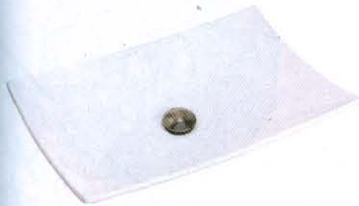
SINK 1443-CWH Above-Counter Lavatory | $220 Decolav decolav.com