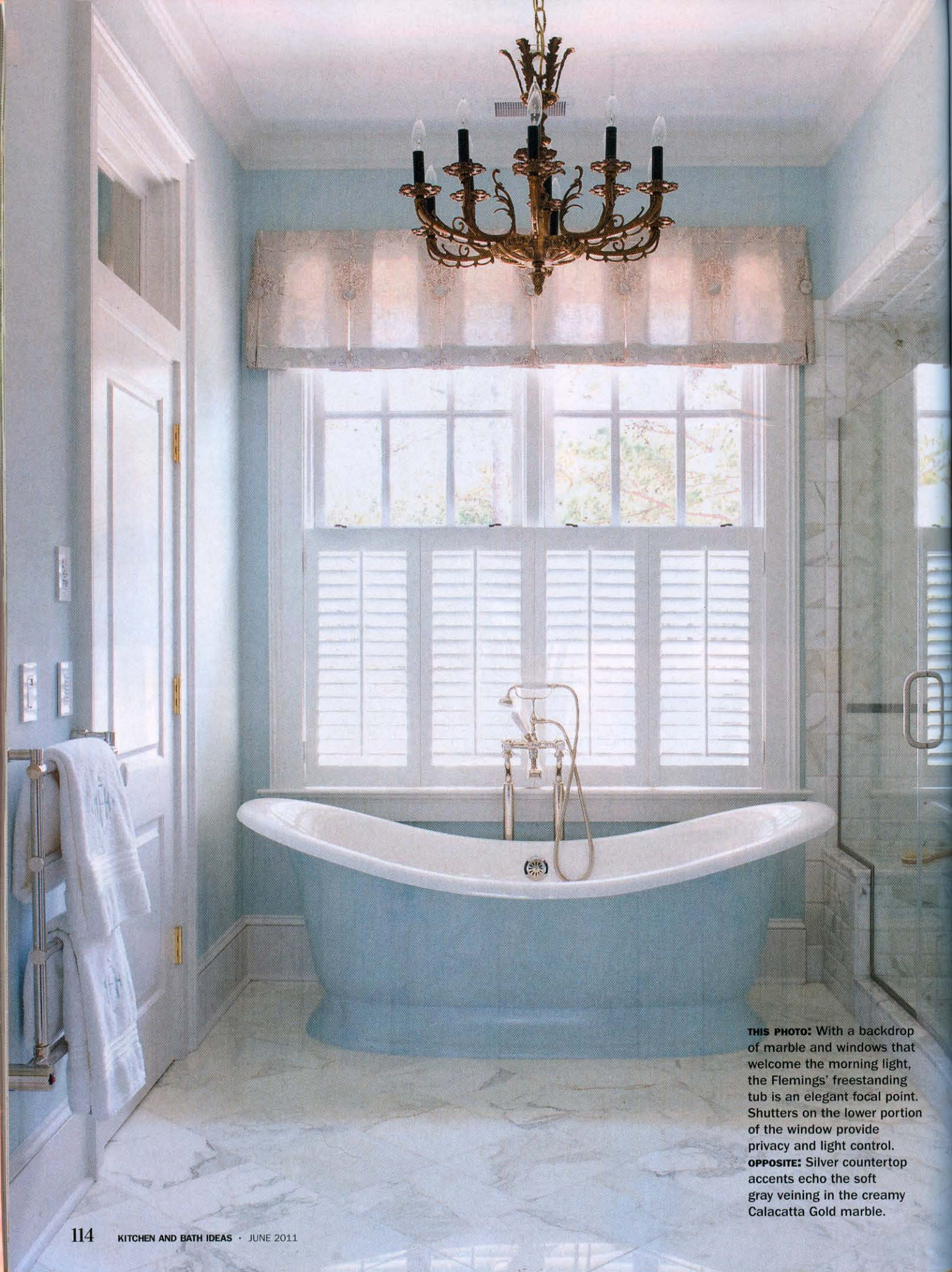
THIS PHOTO: With a backdrop of marble and windows that welcome the morning light, the Flemings' freestanding tub is an elegant focal point. Shutters on the lower portion of the window provide privacy and light control. OPPOSITE: Silver countertop accents echo the soft gray veining in the creamy Calacatta Gold marble.