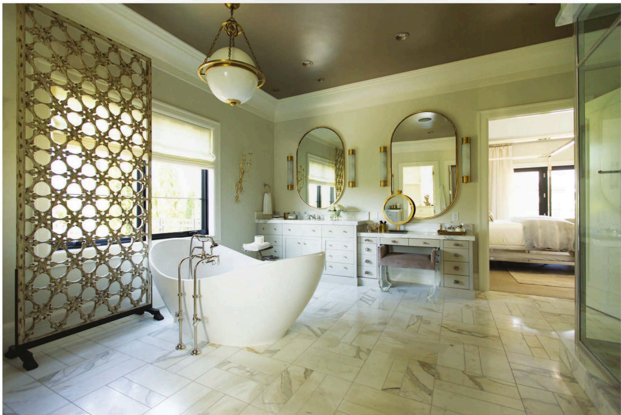
Maximize existing spaces to make room for the bathroom of your dreams.