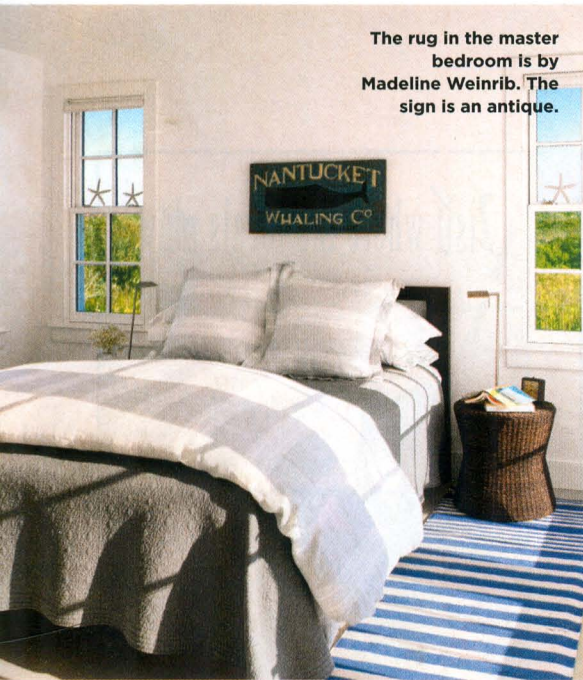
The rug in the master bedroom is by Madeline Weinrib. The sign is an antique.