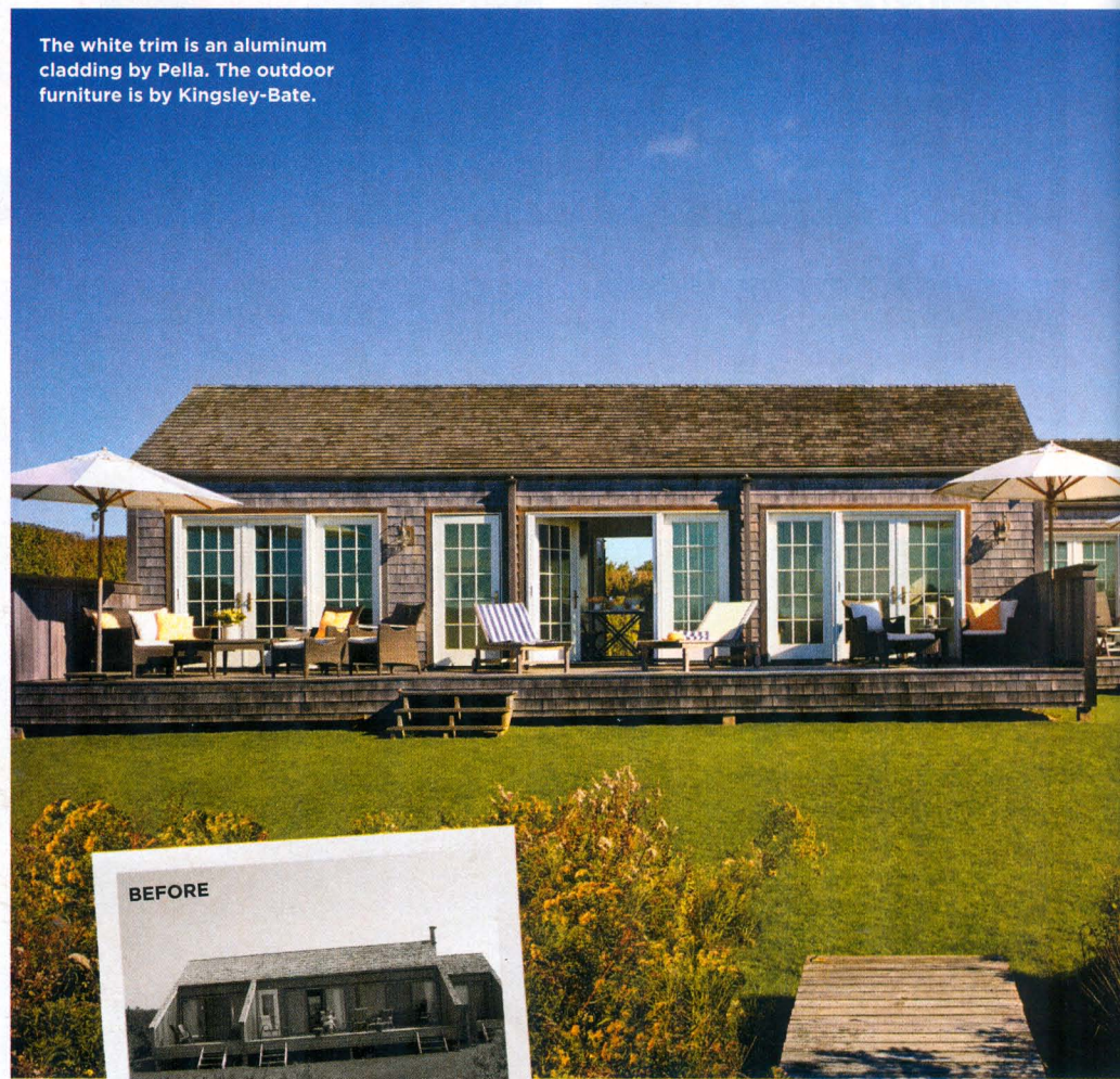
The white trim is an aluminum cladding by Pella. The outdoor furniture is by Kingsley-Bate.

Removing the partitions that had awkwardly divided the deck allowed the owners to reimagine the outdoor living area as a singular gathering hub. "We have our coffee there in the morning and our lunch there in the afternoon," says the homeowner, who added a trio of white market umbrellas for shade and a wicker patio set. "We pretty much live out on the deck whenever we're here." ■ For more information, see Sources, page 100.