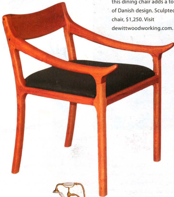
Below: Designed in the contemporary Maloof style, this dining chair adds a touch of Danish design. Sculpted chair, $1,250. Visit dewittwoodworking.com .