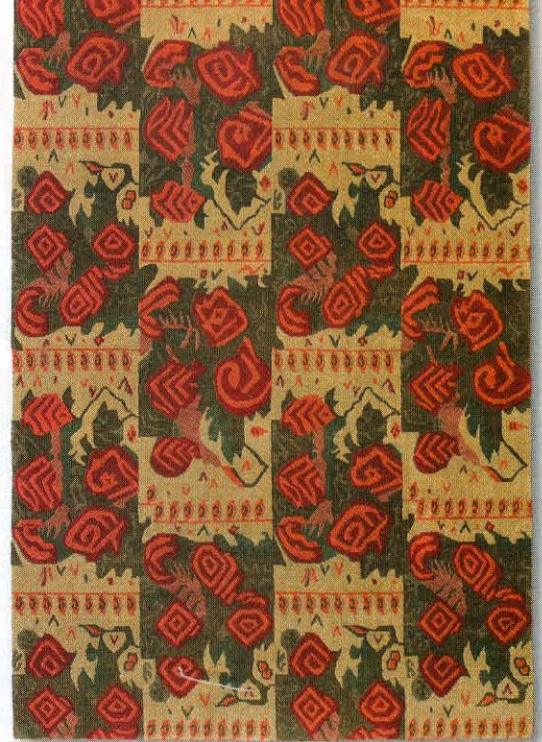
Above: Made from Tibetan wool sourced from Himalayan Mountain sheep, this artisan-crafted rug imparts vibrant style from a traditional Arts and Crafts motif. Wild Irish Rose in green. Visit tigerrug.net .