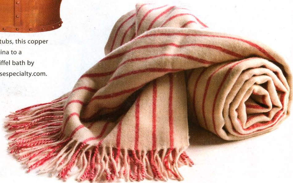
Below: This 100% lambs-wool blanket adds a bit of classic American style to your cottage interior. Matilde stripe throw blanket, $100. (800) 338-7809 or gracioushome.com .