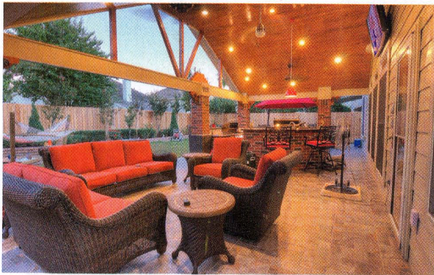
Servicing Houston and Surrounding Areas Over 29 Years