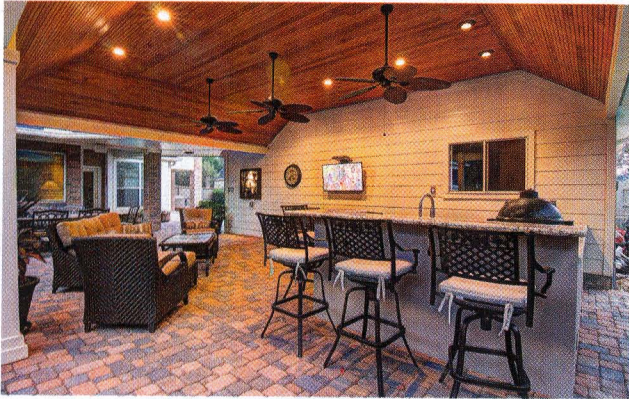
Matching Existing Construction Fully Insured