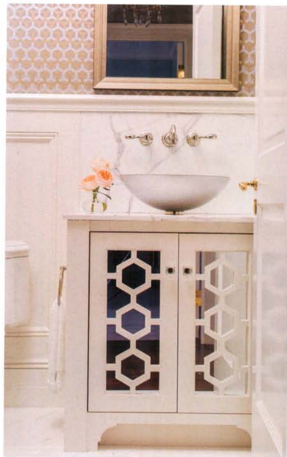
A COZY CHAIR by an arched window (LEFT) makes for a contemplative corner in the master suite. The wallpaper in the powder room (ABOVE) plays off the honeycomb detail in the vanity. The patterned carpet brings depth to the master bedroom (FACING PAGE, TOP), while bits of crystal in the chandelier reflect light even when the fixture is off. In the master bath (FACING PAGE, BOTTOM), the swag of the crystal chandelier is captured in the wallpaper. The bathtub is a limestone composite.

origins are lost in the building's past. The metallic tone is carried onto the striated bronze wallcovering and the arboreal sconces above the sideboard. Yet for all the drama of the stairs, a circular antique table — one of the few furniture favorites the owners had shipped across the seas — anchors the room.