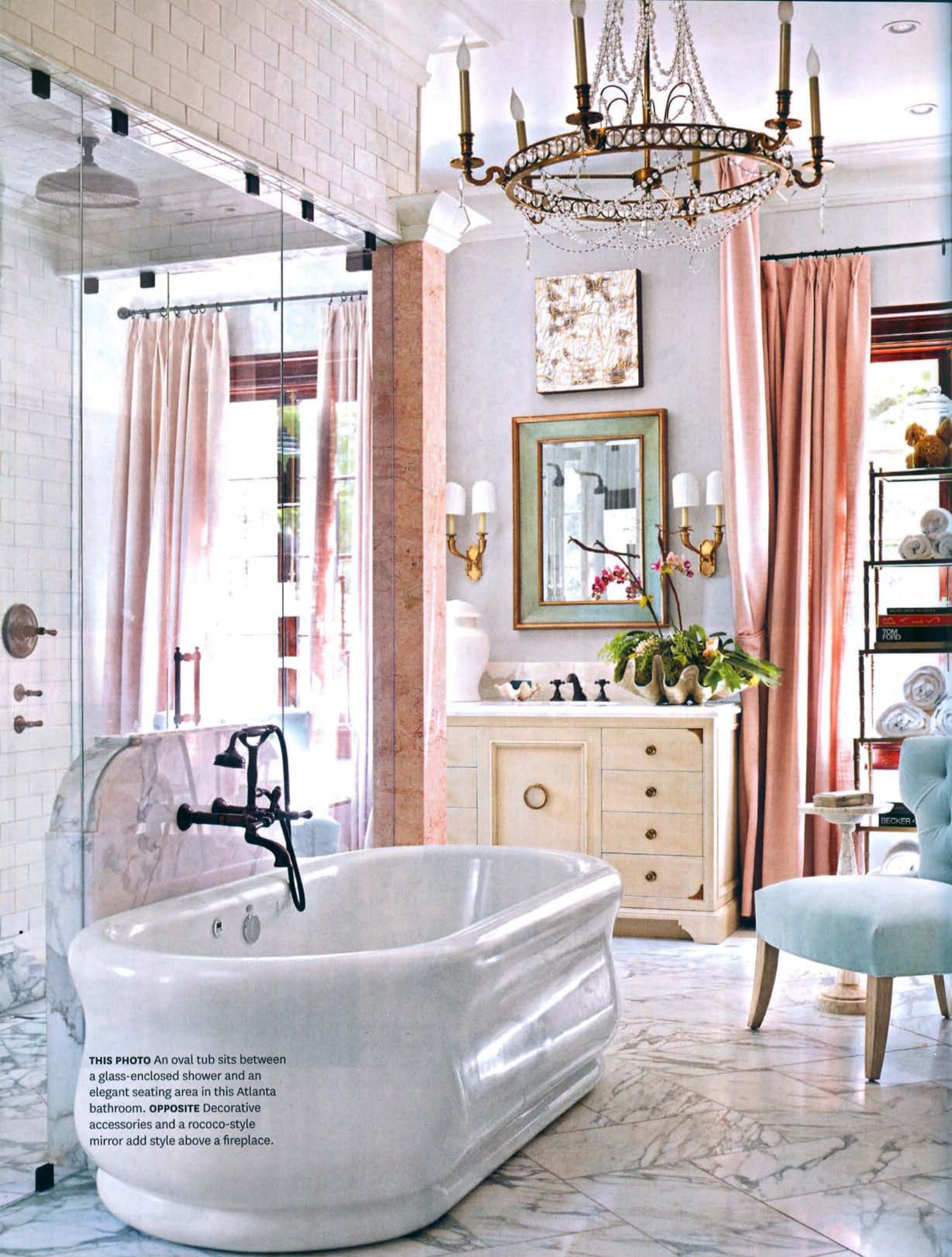
THIS PHOTO An oval tub sits between a glass-enclosed shower and an elegant seating area in this Atlanta bathroom. OPPOSITE Decorative accessories and a rococo-style mirror add style above a fireplace.