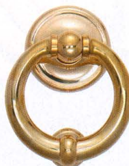
No. 71290 Simple knocker by P.E. Guerin, $948; peguerin.com.