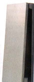
Stainless Steel knocker by Karcher Design, $115; karcher-design.com.