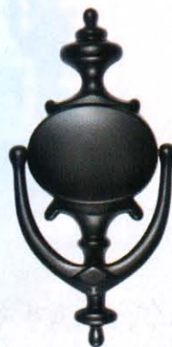
Large Plate knocker by Restoration Hardware, $50; rh.com.