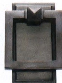
Square knocker by Pottery Barn, $59; potterybarn.com.