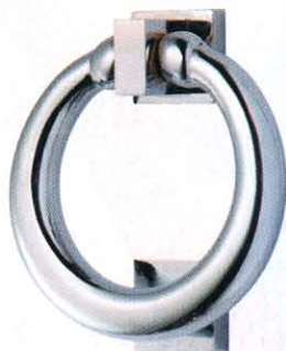
Ring knocker by Samuel Heath, $220; samuel-heath.com.