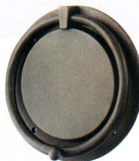
DK825 by Rocky Mountain Hardware, $495; rockymountainhardware.com.