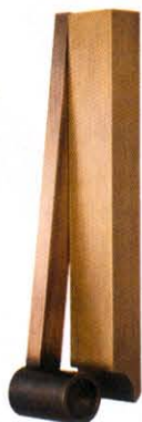
Pendulum by Desu Design, $315; shophorne.com.