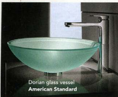
Dorian glass vessel American Standard

PROS: Most glass is stain-resistant and can be cleaned with any household cleanser.