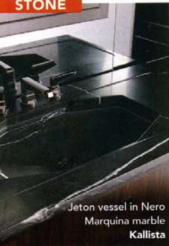
Jeton vessel in Nero Marquina marble Kallista

Bath sinks can be carved from an extraordinary array of natural stones—from granite and marble to onyx, limestone, and even petrified wood. Stone sinks are typically available in vessel (countertop) styles and in a variety of colors. Because stone is so porous, these sinks are often sealed before shipping. It's recommended that they be resealed every year; nevertheless, some designers advise against heavy daily use.