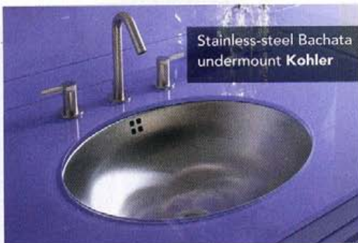
Stainless-steel Bachata undermount Kohler

Stainless-steel sinks come in several gauges, or thicknesses. Thicker metals are naturally more durable—and expensive. Stainless-steel lavs are available in high-end mirrorlike finishes, but it's just extra buffing that gives them that brilliant shine. Brushed finishes don't compromise durability.