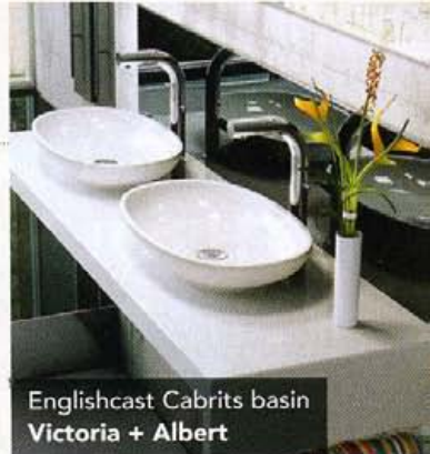
Englishcast Cabrits basin Victoria + Albert