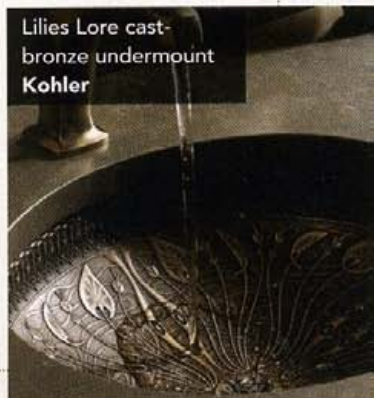
Lilies Lore cast-bronze undermount Kohler