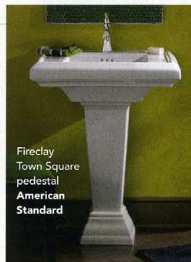
Fireclay Town Square pedestal American Standard

PROS: Fireclay sinks are lead-free and highly resistant to chips, stains, and scratches.