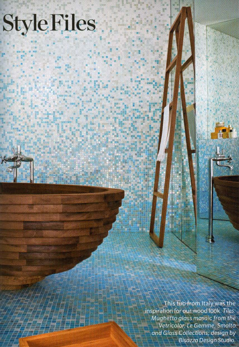
This tub from Italy was the inspiration for our wood look. Tiles: Mughetto glass mosaic from the Vetricolor, Le Gemme, Smalto and Glass Collections; design by Bisazza Design Studio.

Wood and wood-look items are turning up everywhere. Here, our fave bathroom items.