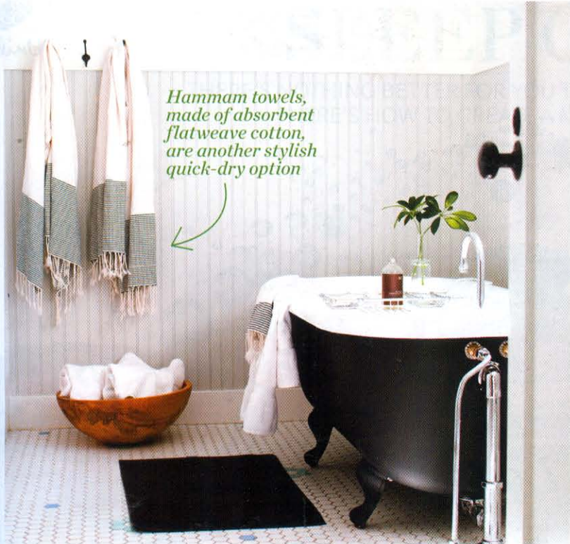
Hammam towels, made of absorbent flatweave cotton, are another stylish quick-dry option