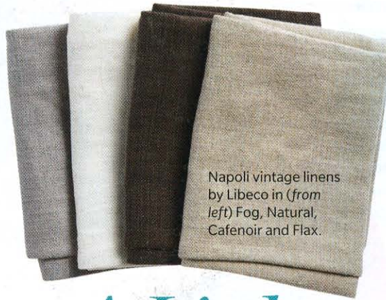
Napoli vintage linens by Libeco in (from left) Fog, Natural, Cafenoir and Flax.