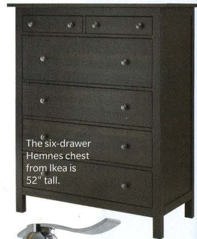
The six-drawer Hemnes chest from Ikea is 52" tall.