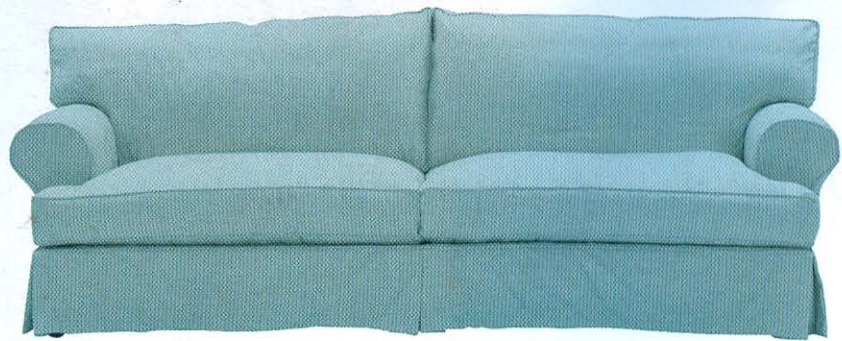
The Nicki II slipcovered sofa from Mitchell Gold + Bob Williams is 88" long, through Elte, Celadon Collection and Brougham Interiors.