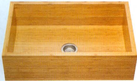
A bamboo version of the farmhouse apron sink, from Lenova Sinks.