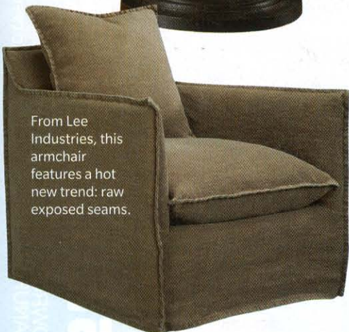
From Lee Industries, this armchair features a hot new trend: raw exposed seams.