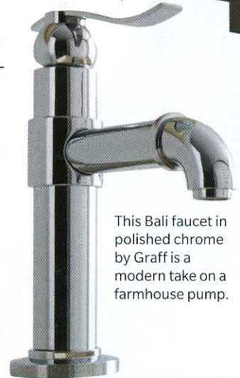
This Bali faucet in polished chrome by Graff is a modern take on a farmhouse pump.