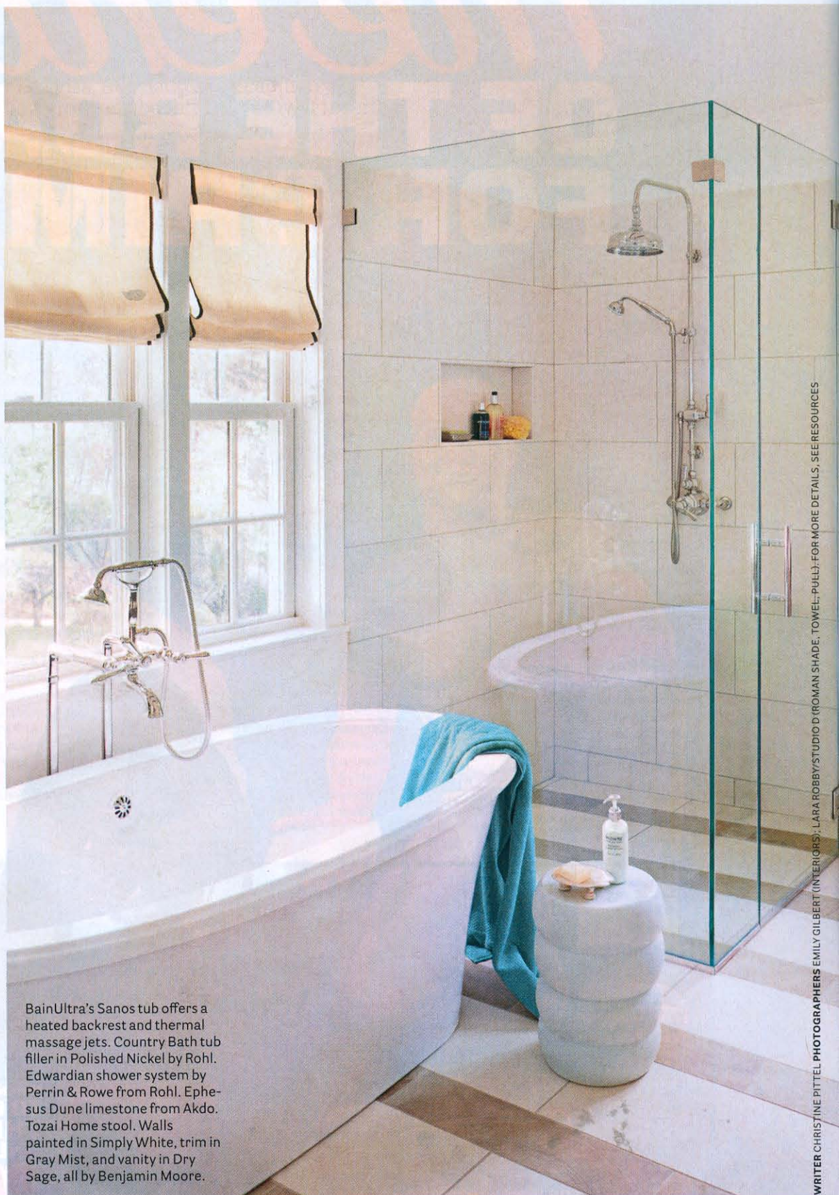
BainUltra's Sanos tub offers a heated backrest and thermal massage jets. Country Bath tub filler in Polished Nickel by Rohl. Edwardian shower system by Perrin & Rowe from Rohl. Ephesus Dune limestone from Akdo. Tozai Home stool. Walls painted in Simply White, trim in Gray Mist, and vanity in Dry Sage, all by Benjamin Moore.

That creates a nice counterpoint to the old-fashioned fixtures, the Jacobean-style chair, and the drop-leaf table, topped with a lamp. "Lamplight is very cozy and adds to the warmth as soon as you walk in," she says. "I like to use real furniture in a bathroom. It softens all the hard surfaces. Too many built-ins turn me off. I want to be unique and different."