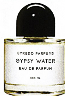
GYPSY WATER EAU DE PARFUM; BYREDO.COM

"This perfume is soft and citrusy, but also woody and spicy. It's a unisex fragrance, but I think a woman wears it better."