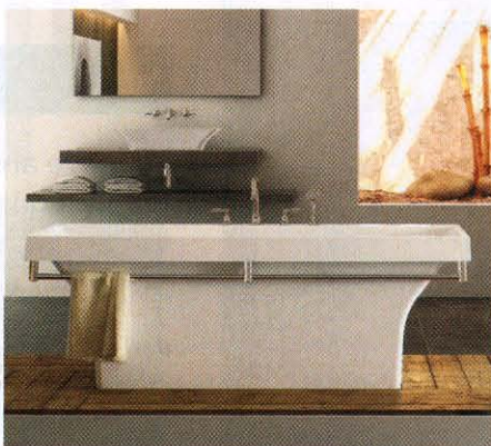
Capri, $3,950 , Victoria + Albert, 800/421-7189, vandabaths.com

INDUSTRIAL looks stress linear design, hard edges, and polished-metal accents.