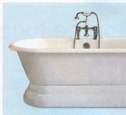
Palais pedestal soaking tub and tub filler with handheld shower, $4,150 , Restoration Hardware, 800/910-9836, restorationhardware.com

COTTAGE -inspired tubs have curvy basins, rounded edges, and crisp white finishes.