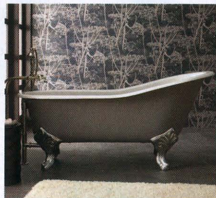
Epoque high-back bathing pool with legs, $3,595 , Porcher, 800/359-3261, porcher-us.com

VINTAGE models are elegantly detailed with claw feet and floor-mount fixtures.