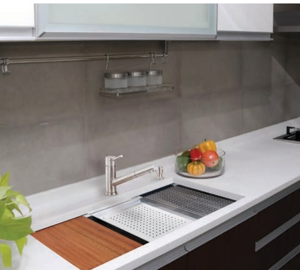
Lenova's Ledge prep sink won one of Interior Design's Best of the Year Awards for the Kitchen Fixtures category last December. Ledge is available in three models, each with a 90-degree ledge pressed into the front and back of the sink that converts it to a food prep center when it is accessorized with an optional stainless steel colander, wood cutting board or roll-up stainless steel grid drainer. The collection includes two 33-in. x 22-in. sinks and one single and one double bowl, and the sinks can be undermounted or mounted as drop-ins. Circle No. 251 or visit kbbonline.com/freinfo