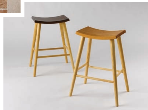
The Crescent High Stool from Thos. Moser is topped with a backless, steam-bent seat and can be accessed from the front, back or either side. The lightweight, durable stool can be tucked under a counter when not in use, and its ash legs provide a contrast to cherry or walnut seats. Circle No. 252 or visit kbbonline.com/freinfo