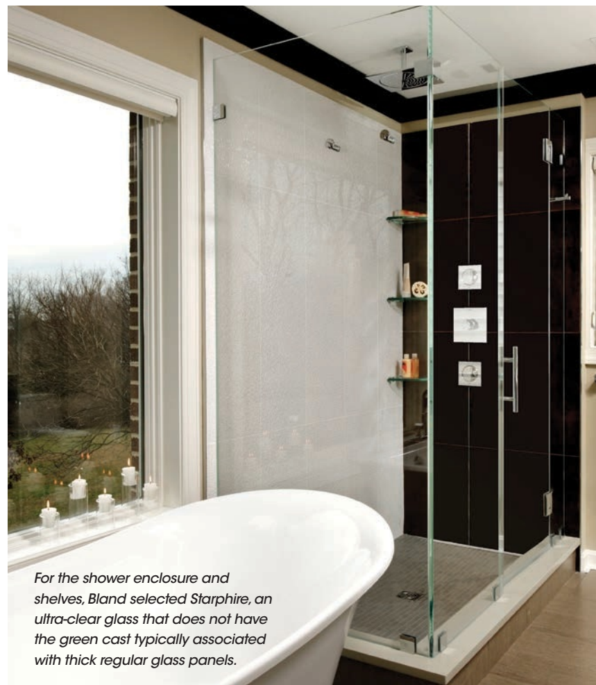
For the shower enclosure and shelves, Bland selected Starphire, an ultra-clear glass that does not have the green cast typically associated with thick regular glass panels.

"From a style standpoint, they wanted a space that was restful, serene and had a certain level of sophistication to it," she said. "We were going for a little bit of glamour seen in high-end hotels."