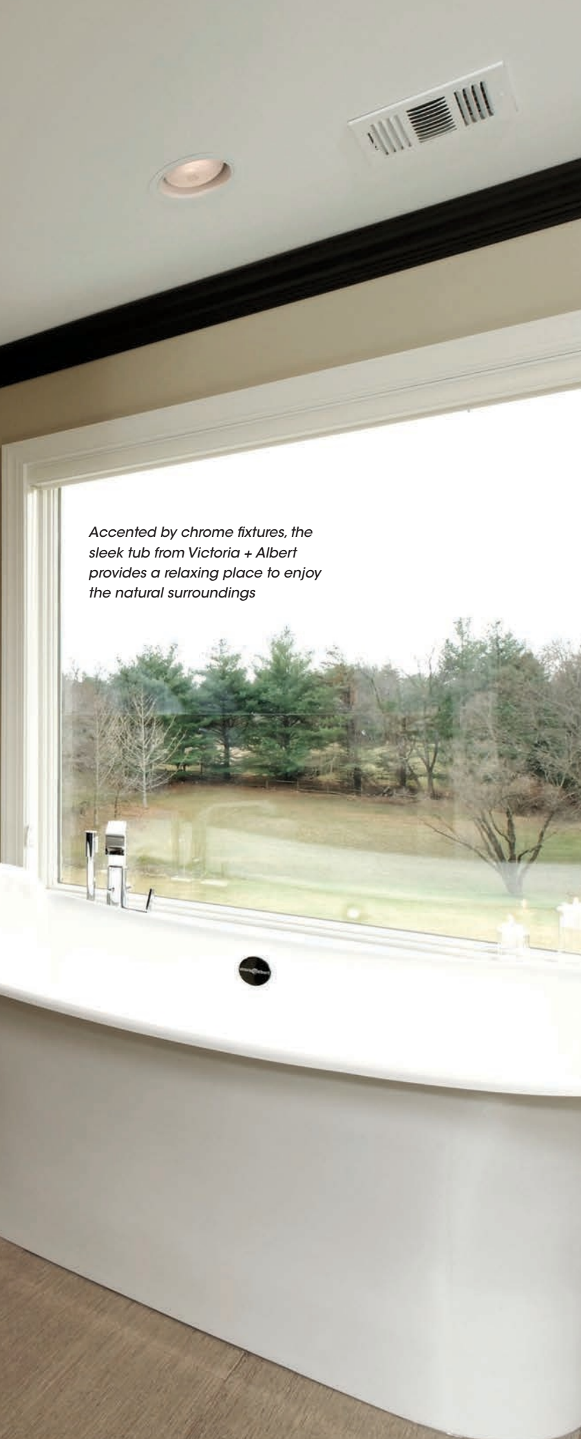
Accented by chrome fixtures, the sleek tub from Victoria + Albert provides a relaxing place to enjoy the natural surroundings

At first glance, it might have looked like a significant design challenge. A Potomac, Md., master bathroom was in the midst of a renovation – a cramped, compartmentalized renovation at that. Interior walls partitioned the space and blocked in a Jacuzzi tub. His-and-hers vanities were built, but they were undersized, as was the shower. Closets further cluttered the room.