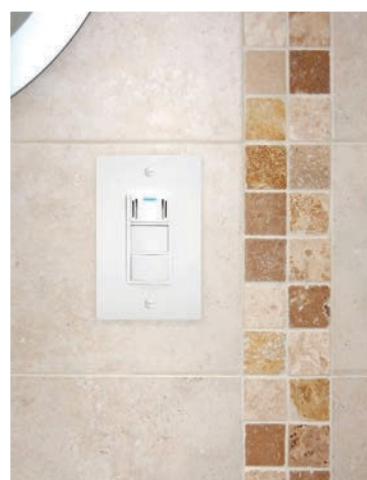
The WhisperControl Condensation Sensor from Panasonic's Eco Products Division is a wall-mounted humidity and temperature sensor that anticipates condensation and automatically turns on ventilation fans to remove humid air. The sensor can function in every climate zone to control mold and mildew, is available in two models and features a blue LED light and a manual on/off fan and light switch. Both models are offered in white and light almond. Circle No. 250 or visit kbbonline.com/freinfo