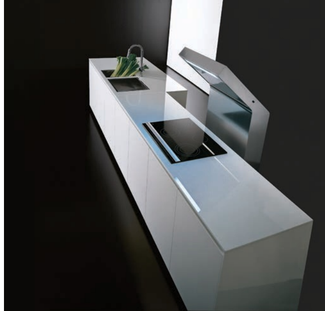
Effeti's L'Evoluzione kitchen system features electronically controlled drawers and doors and offers increased functionality and a more natural flow from the kitchen into the living area. The system is available with the company's branded drawer organizers, as well as in 11 kinds of wood and a variety of glossy laminates and lacquers. Custom colors and finishes are also available. Circle No. 248 or visit kbbonline.com/freinfo