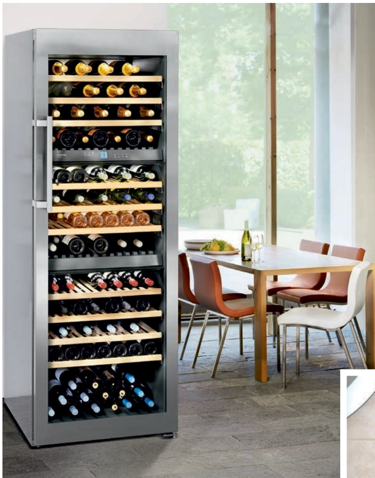
Liebherr's WS 17800 Vinidor wine storage unit is designed to hold a large supply of wine or champagne and features vibration-free compressors, double-glazed doors, forced air cooling and a fresh air supply via activated charcoal filters. The unit offers wooden shelves on pullout rails and an accurate electronic control system with touch technology and a digital temperature display. Circle No. 249 or visit kbbonline.com/freinfo