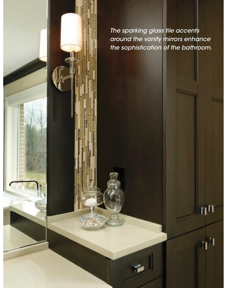
The sparkling glass tile accents around the vanity mirrors enhance the sophistication of the bathroom.

"Bringing in the sparkly glass tile offered a way to lighten the area," said Bland. "It became the exclamation point of the bathroom." ■