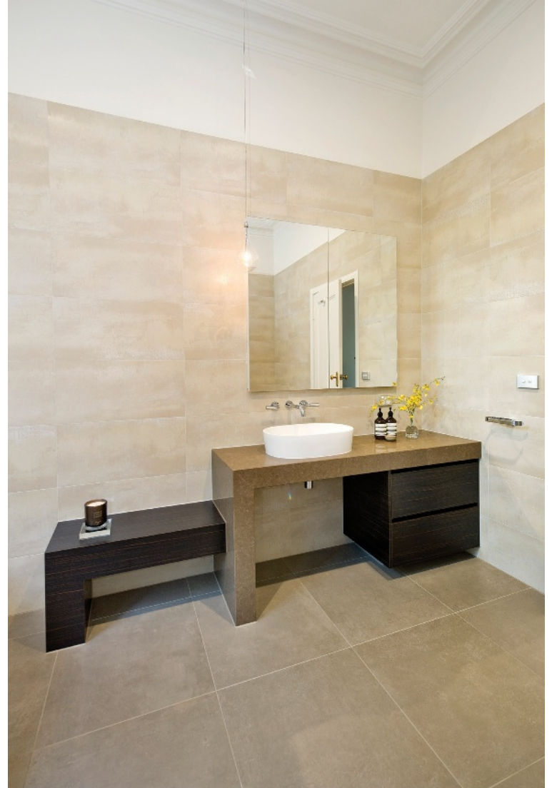
Task lighting brightens up the vanity area, and bench height as well as possible future wheelchair access to the sink were considered and applied in the design of this universal bathroom in Melbourne, Australia.

"We considered the clients' needs and came up with alternative, yet functional solutions," he said. "No grab rails are currently required."