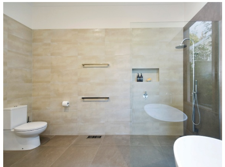
A freestanding, stone composite bathtub with a seating area was used to create initial impact upon entry into the space. A water-saving toilet and showerhead were also used in the design.