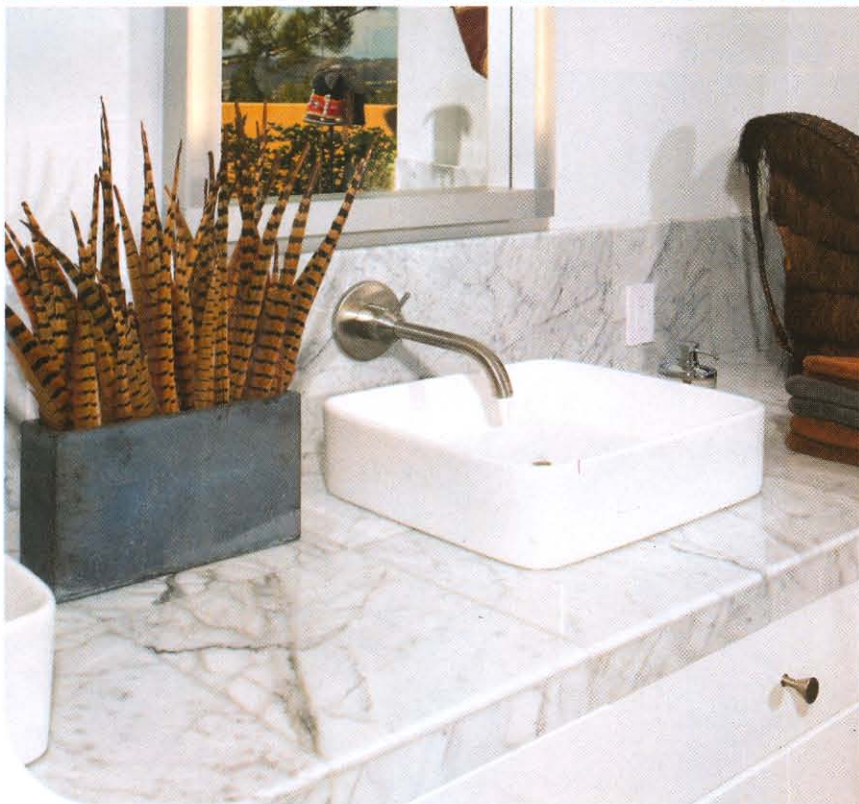
The bathroom's minimalist interior is kept light with neutral colors and materials, including white Corian walls and textured gray stone in the shower (above left); white porcelain tile with gray grout and gray walls throughout (above); and white marble with gray veining in the vanity area (left). A freestanding tub resembling a piece of sculpture is situated in front of a large, arched window (below).