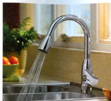
18 | American Standard Brands' Colony Soft kitchen faucet features a high-arc design, 360-degree swivel spout and a three-function pull-down handspray. The Colony Soft is constructed of solid brass and includes a water temperature memory setting. Circle No. 182 on Product Card