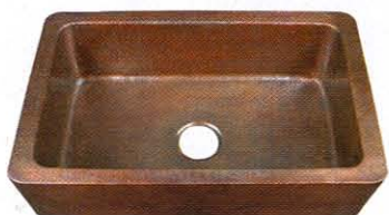
16 | Barclay Products offers a handcrafted farmer sink style in hammered antique copper. The single bowl sink measures 31-3/4"x21-1/4" with a 9" basin depth. The untreated copper is a living finish and each piece will develop a unique patina over time. Circle No. 180 on Product Card