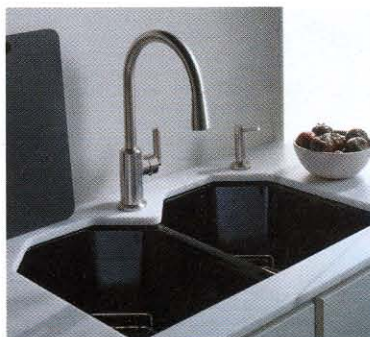
23 | The cast iron kitchen sink from Kallista is a dual-basin model that allows for single-hole kitchen faucets, with additional drillings to fit a soap lotion dispenser and side spray. Made from 93 percent recycled or reclaimed materials, the sink measures 33" (L) and 9" (D). Circle No. 187 on Product Card