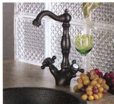
22 | California Faucet's Santa Barbara series sports a clean, single-hole design and n-turn ceramic disc valves. Shown in English Rubbed Bronze, a PVD finish similar to Oil Rubbed Bronze, the faucet adds a rustic look to a bar environment. It is available in more than 34 finishes. Circle No. 186 on Product Card