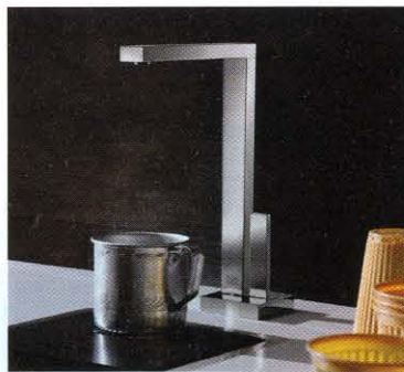
24 | The LOT Water Dispenser from Dornbracht was created by Sieger Design. The dispenser is available in both stand-alone hot water and hot-and-cold water models. The water dispensers are designed for use with InSinkErator's water filter and tank set. Circle No. 188 on Product Card