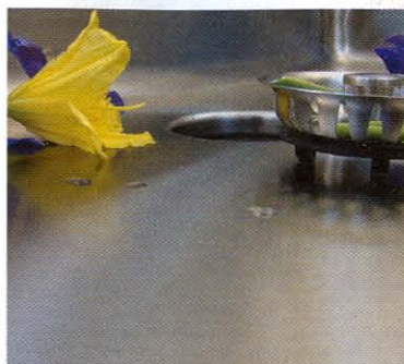
17 | The sanitary, seamless sink bottom created by Affluence Seamless Sink includes a removable, cleanable disposer splash guard. The disposer and drain allow for a 90-second install, the firm notes. Circle No. 181 on Product Card