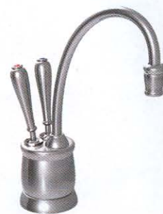
25 | InSinkErator presents its Indulge Series of instant hot water dispensers, which includes two models: Tuscan (pictured) and Antique. Both styles are traditionally styled and available in hot/cool and hot-only water models. They are available in 11 finishes. Circle No. 189 on Product Card