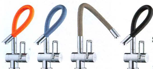
20 | The Arwa-Twinflex contemporary kitchen faucet from Gemini Bath & Kitchen Products features a flexible spout in Brilliant Orange, Pigeon Blue, Kashmir Beige or Satin Black. The faucet also features a chrome finish and the hygienic, water-saving Trigon system. Circle No. 184 on Product Card

Universal Design. Awareness of the need for universally designed products has increased dramatically in the past several years, states Schrage. "This awareness has focused attention on many products already in the marketplace whose features and benefits may not have been noticed or appreciated before," she notes.