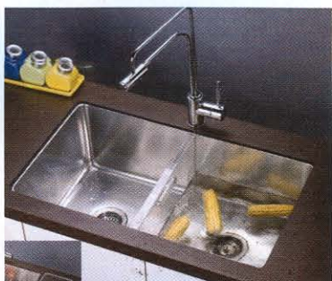
21 | The Single Combo sink from Dawn Kitchen & Bath Products is accessorized with a removable plastic divider. The sink is made with 16-gauge 304 stainless steel. Circle No. 185 on Product Card

Delta has developed pull-out kitchen sprays and wands with Multi-Flow technology that provides consumers with a choice of water flow rates based on