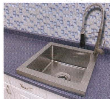
19 | Advance Tabco's A-Line Raised Deck countertop sinks are made of heavy-gauge stainless steel and have a satin finish. Features include a 2" raised deck that eliminates splash over and a 3" rear deck that will accommodate a large variety of faucet models. Circle No. 183 on Product Card