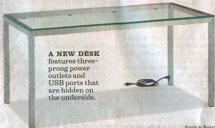
A NEW DESK features three-prong power outlets and USB ports that are hidden on the underside.