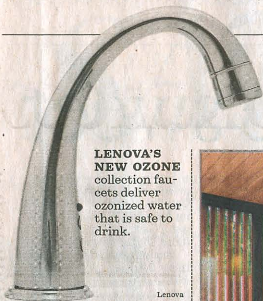
LENOVA'S NEW OZONE collection faucets deliver ozonized water that is safe to drink.