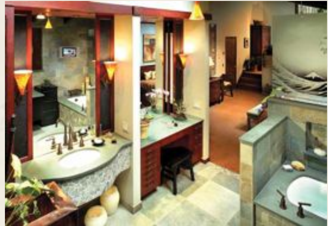
First page: 'It's kind of like a car wash': A master suite may feature a shower with enough room for two and enough showerheads for six. Above: Beyond bed and bath: Inspired by the hospitality industry, master suites are becoming one open space with luxurious amenities like heated floors in the bathroom and a TV by the tub. designed by Holly Rickert.

3035 Ayres Chapel Road | White Hall, MD 21161 | 410.557.7311 | SouthFen.com | Facebook.com/southfen