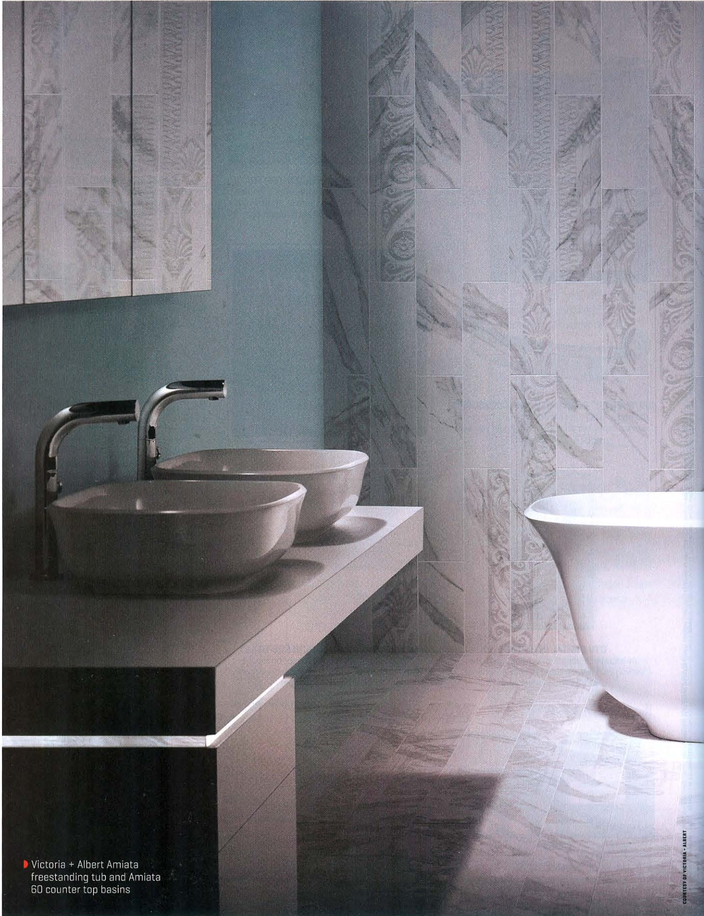
▶ Victoria + Albert Amiata freestanding tub and Amiata 60 counter top basins