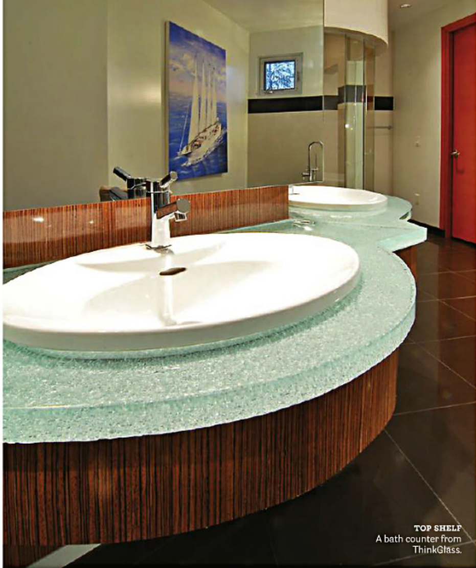
TOP SHELF A bath counter from ThinkGlass.

Though some clients might have reservations about the fragility of glass—some have worried about it cracking when objects are placed on it—Charest says it's the same thing as placing things on translucent granite countertops because sand (the main component of glass) is essentially made from rock. It is the same specification and same idea, except the