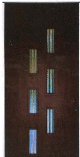
Fontenot door, Crestview Doors, (866) 454-6302, crestviewdoors.com