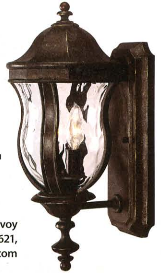
Wall-mount lantern, Savoy House, (800) 801-1621, savoyhouse.com