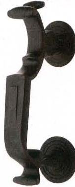
S-style door knocker, Baldwin Hardware, (800) 566-1986, baldwinhardware.com

As with their interiors, Victorians didn't skimp on decking out their entryways. Arched-panel double entry doors were popular on styles from Second Empire to Italianate, and often were embellished with torch-style lights (which once burned gas) to warm the front steps, plus mail slots or boxes displaying echoes of the era's fine filigrees.