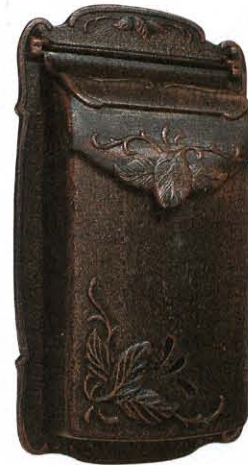
Vertical floral design mailbox, House of Antique Hardware, (888) 223-2545, hoah.biz