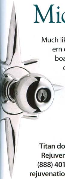
Titan door set, Rejuvenation, (888) 401-1900, rejuvenation.com