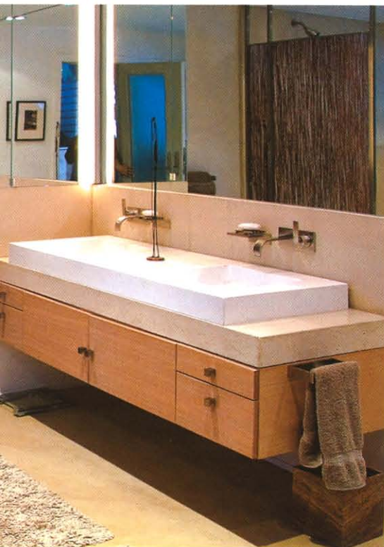
CLOCKWISE FROM TOP LEFT: The concrete vessel sink and warmly colored countertop are by J. Aaron Cast Stone. For this project, artisans at Buddy Rhodes made concrete in custom colors of moss and slate-green, inset with veins of sand and coal, to complement earthy Motawi tiles. Horizontal expanses of concrete top a floating vanity in this Asian-inspired bathroom by FormFunction Concrete.