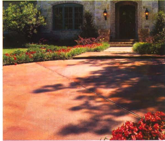
LEFT TO RIGHT: Concrete is as elegant as it is practical for an outdoor spa; this one is by Sonoma. Kemiko products were used to stain this custom interior floor. Colored and sealed concrete makes a luxury driveway (Kemiko). BELOW: The “wave sink” by Sonoma Cast Stone is an example of their metal-finished concrete.

Handmade by skilled craftspeople, custom-designed concrete requires time, skill, and expertise; it usually runs about $100 per square foot, about the cost of high-grade marble or granite.