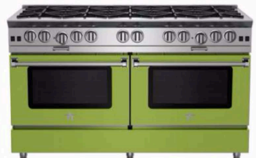
BlueStar appliance in Pantone’s 2017 Color of the Year, Greenery