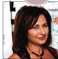
SILVANA LONGO EDITOR

HEAD SCRATCHER This sink has plenty of cool factor. At first look, you will be asking yourself, "Where does this sink begin and where does it end?" Its ingenious construction uses the countertop cut-out to form the bottom of the sink, creating an illusion of a seamless design, which allows the striations of the counter material to visually flow 'through' the sink. Only the top two inches of the rim rest on the countertop, although that may be extended up to 4.25" on request. Continuum sink, $1,030; mtibaths.com