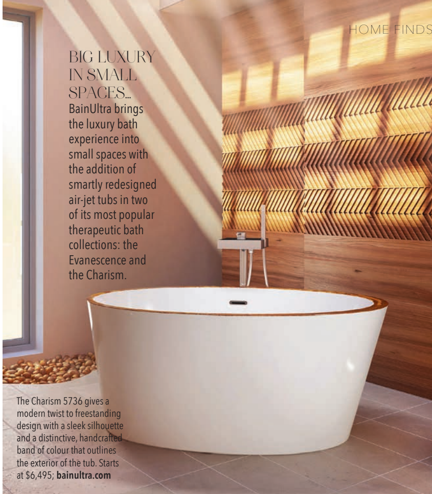
The Charism 5736 gives a modern twist to freestanding design with a sleek silhouette and a distinctive, handcrafted band of colour that outlines the exterior of the tub. Starts at $6,495; bainultra.com

BainUltra brings the luxury bath experience into small spaces with the addition of smartly redesigned air-jet tubs in two of its most popular therapeutic bath collections: the Evanescence and the Charism.