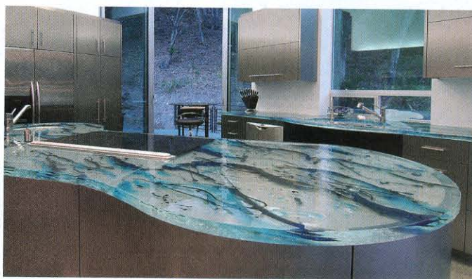
ThinkGlass offers glass kitchen countertops, backsplashes and raised bars. Its exclusive technology can make unique kitchen countertops in thicknesses of 1½ in. or more. These countertops come with a smooth, glossy finish and a choice of embedded textures that can be infused with color. + FOR MORE INFO CIRCLE #23