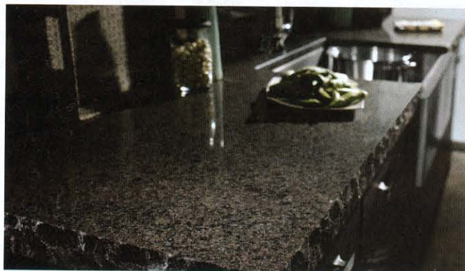
Cambria's Quarry Collection offers a variety of warm, rich tones that are designed to showcase the variation of natural quartz stone. The collection contains 28 colors, including Williston, which is shown here. + FOR MORE INFO CIRCLE #24