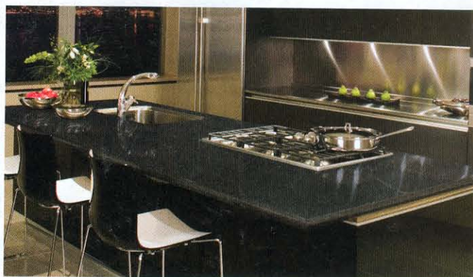
Hanex Solid Surfaces are crafted from a unique blend of acrylic resins and natural materials. They can be cut, shaped and formed to fit a range of designs. The surface can be fabricated and installed in almost any application with invisible seams. + FOR MORE INFO CIRCLE #22