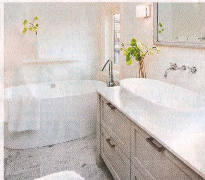
Left to right: The BainUltra Ayoura air-jet bath, Kohler Chromatherapy tub and Victoria + Albert IOS bathtub.

PHOTOS COURTESY BAINULTRA, KOHLER AND VICTORIA + ALBERT