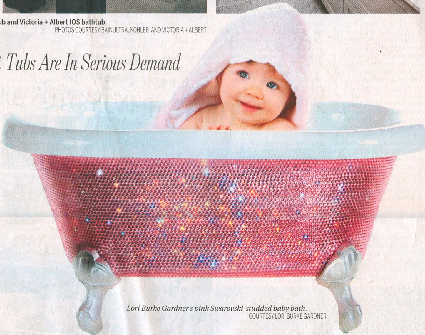
Lori Burke Gardner's pink Swarovski-studded baby bath.

Incorporating exquisite form and function, the newest luxury baths offer the ultimate in haute water relaxation. The pool from which to choose them from is forever deepening.