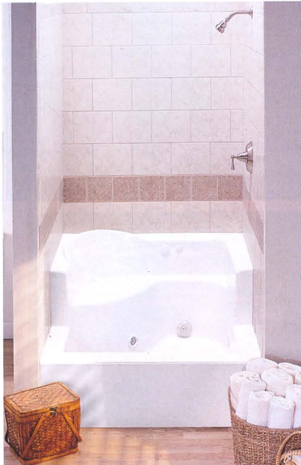
Jeu d'Eau Seated Shower Base with swirling footbath

M ulti-generational design is one of today's fastest growing trends in the housing industry. As more and more people understand the benefits that smart planning affords to those of all age groups and abilities, a demand is being generated for products that combine style, safety, beauty and comfort with practicality and versatility. In fact, it's what good, smart design should be.