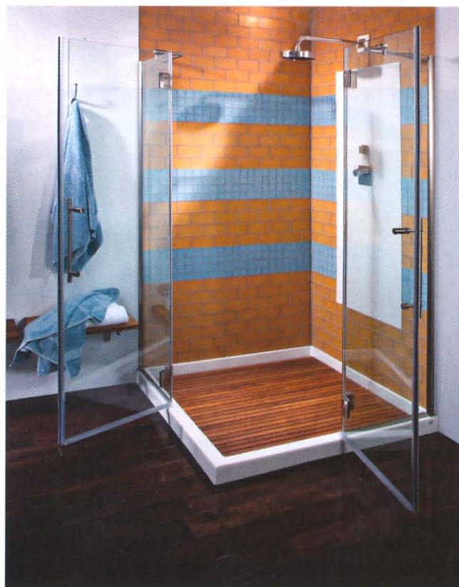
Low-Profile Base with Dual Threshold Double Door Enclosure and Teak Shower Tray

Complementing MTI’s extensive assortment of shower bases are frameless shower enclosures with a headerless design. When spacious access to the shower is a consideration, MTI enclosures can assist. For instance, one enclosure offered mates with a 48” x 48” dual threshold shower base. Two doors that meet at one corner open a full 180°