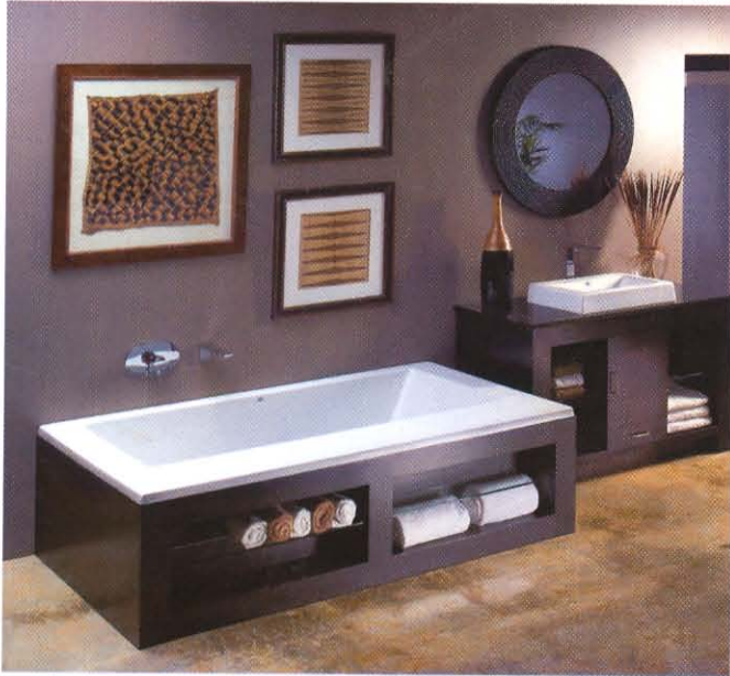
Metro Tub and surround with matching vanity

each to provide a spacious French-door-like entrance to the shower, offering both beauty and practicality. MTI's largest base of 72" x 42" can be equipped with one or more sides of glass enclosure for a wonderful feeling of open spaciousness. A large pivoting door provides access. Or, if space is a consideration, select an enclosure from MTI's Teutonic Series, which features enclosures with a sliding glass door that glides with rollers along an overhead stainless steel rail to provide easy entrance to the shower with no bottom track.