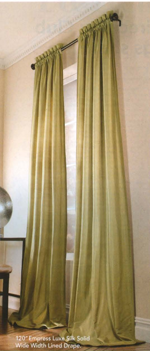
120" Empress Luxa Silk Solid Wide Width Lined Drape.