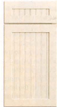
Classic Avenue Maple in Chiffon, about $600 for a 40" base cabinet; merillat.com for dealers.