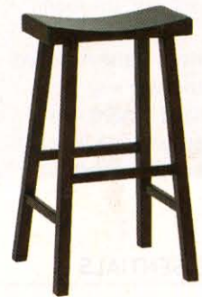
Tall Tibetan Barstool with Mahogany Stain, $119; potterybarn.com .