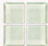
Glass Blox in Moonbeam, $19-$24 per 12" x 12" mosaic sheet; crossvilleinc.com .