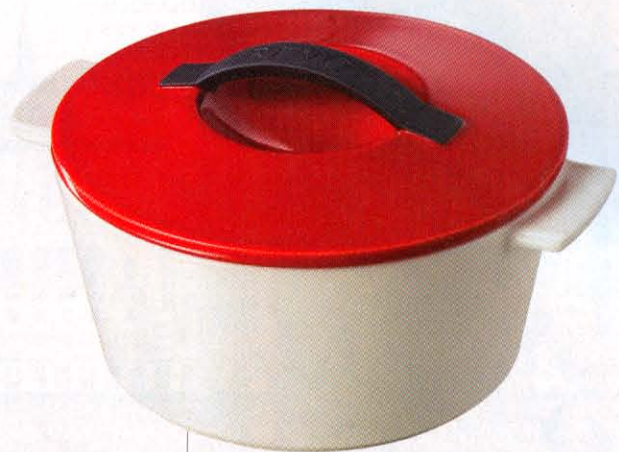
REVOLUTION by Revol pot, 1.75-quart pot, $164.95. 3.75-quart pot, $249.95. (212) 966-3434 or broadwaypanhandler.com .