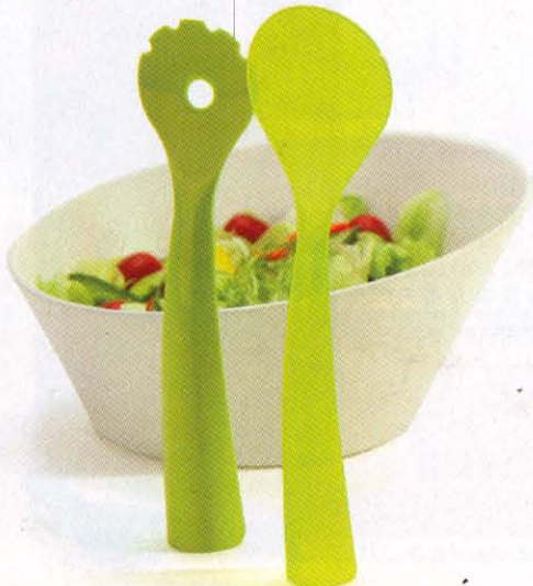
UMBRA salad spoons, $10. (800) 387-5122 or umbra.com .