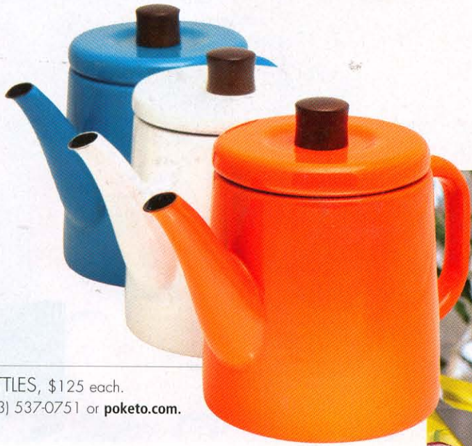
KETTLES, $125 each. (213) 537-0751 or poketo.com .