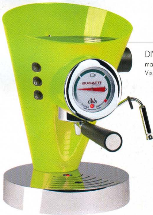
DIVA espresso machine, $1,000. Visit casabugatti.it .