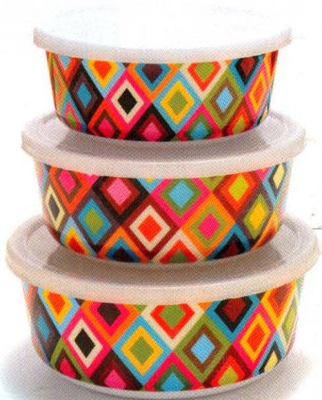
MOSAIC food storage container set, $34. (773) 687-9658 or sparkliving.com .