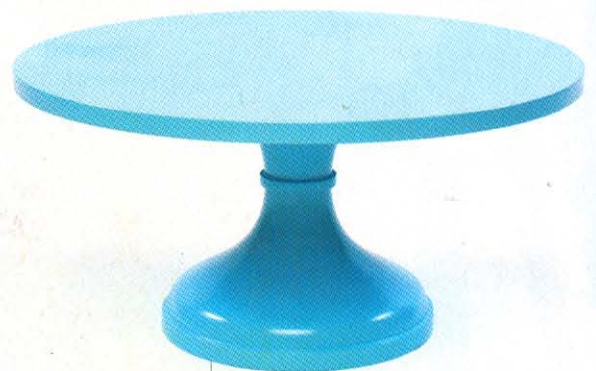
SEA of Love cake stand, $145. Visit sarahsstands.com .