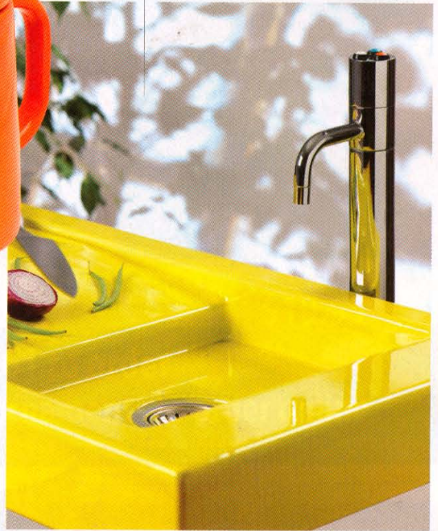
PYROLAVE integrated kitchen sink, $4,500. (919) 788-8953 or pyrolave.com .