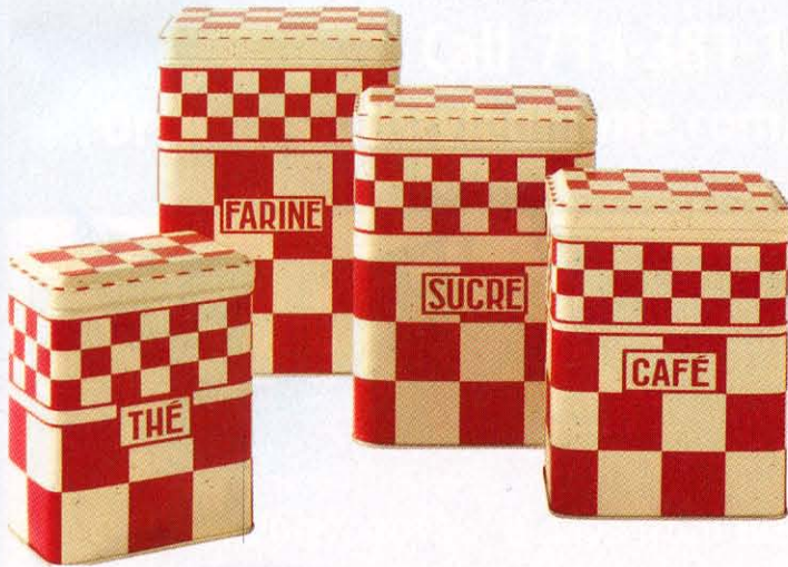
RED checkered canisters, $34.99 set of 4. (503) 521-0745 or blazingthyme.com .