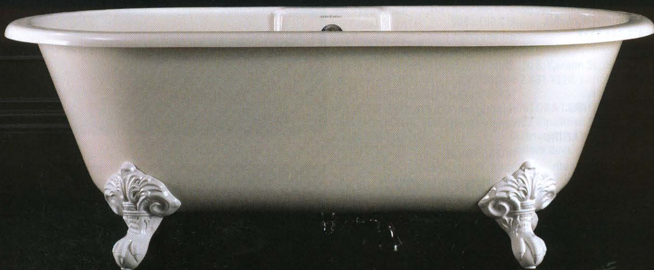
Victoria & Albert Cheshire Collection soaking tub, $2,200. Splash.

As the water fills the tub, we lean our heads back, breathe a sigh of contentment, and as our feet dangle delicately over the tub's edge, we indulge in the comfort that only comes with a bath. The bathtub is no longer simply a pseudo-swimming pool in which kids can splash uproariously, sloshing water on the tiled floor. It's a chic bathroom accent, complementing faucets and mirrors, and a gorgeous piece that conjures images of serenity at the end of a long, autumn day. This classic Cheshire tub is deep enough to lounge comfortably with a book — we recommend starting with Alice In Wonderland to go with the tub's Cheshire theme — and is strikingly footed, giving a sophisticated tone to the smallest of rooms. To top it off, the tub is made from finely ground volcanic limestone (porcelain is a thing of the past). So curl up, chill out — or rather, warm up — and take a bath. @