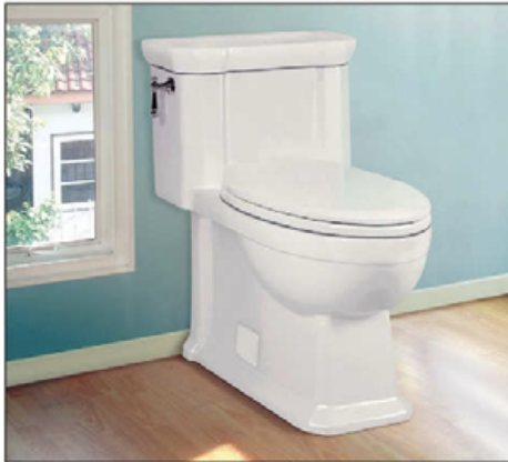
ICERA Richmond II

ICERA appreciates the beauty of clean lines as evidenced by the chic look of its new Richmond II toilet with a fully skirted bottom. A redesigned version of one of its most popular toilets, the Richmond II offers a transitional style that works well in any décor. A teardrop lever adds a touch of elegance, while the elongated