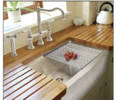
Lenova PermaClean Apron Front Ledge Prep Sink

ern twist of a classic look with sleek lines and a graceful 10-inch bowed front, this phenomenal sink is a true workhorse in today's kitchen. Available in a single or double bowl configuration, one of the most notable aspects of the