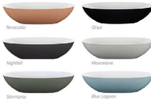
MTI Baths organic hues

Nothing adds style to a space like an unexpected splash of color. MTI Baths greatly expands the color palette in the bathroom with six new organic hues inspired by the earth, sea and sky. Available on a select number of tubs and vessel or semi-recessed sinks, these elegant exterior colors have names that capture the essence of the outdoors, including Blue Lagoon, Nightfall and Moonstone. Offered in a matte