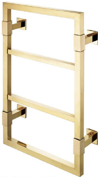
The Sterlingham Co. Arley towel warmer

The Sterlingham Co. offers its own take on the brass trend with a modern and mini-