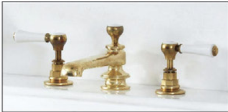
Victoria + Albert Unlacquered Brass finish

a gorgeous Unlacquered Brass finish available exclusively on its Florin and Staffordshire faucet collections. Known as a "living finish," Unlacquered Brass ages naturally by developing a unique patina over the lifespan of the fixture. The absence of a protective lacquer allows the durable solid brass to gradually darken and reveal subtle undertones of color and texture. Victoria + Albert developed the Unlacquered