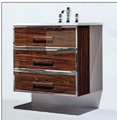
The Furniture Guild Riva 406

With its sleek modern vibe, the Riva 406 vanity from The Furniture Guild is a perfect example of this type of motif. It is available in