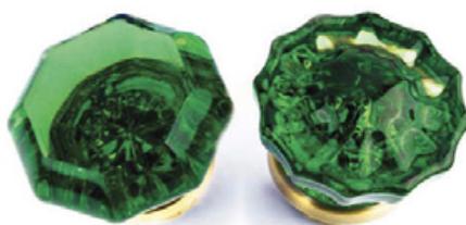
Nostalgic Warehouse crystal doorknobs

Nostalgic Warehouse makes it easy to make a memorable entrance to any bathroom