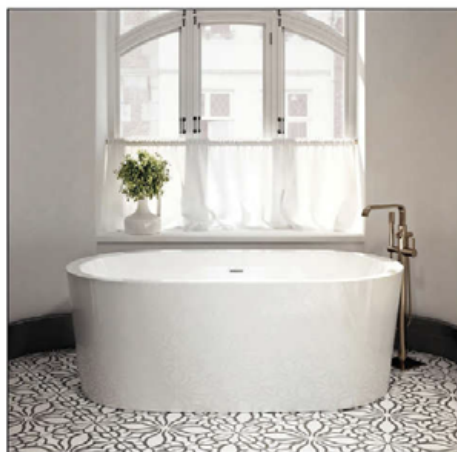
BainUltra Nokori Oval 6737

BainUltra's Nokori Oval 6737 is an oval-shaped iteration of a geometric line of free-