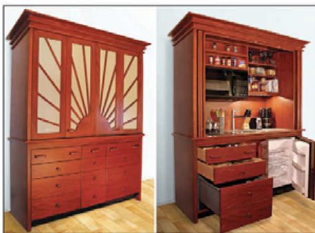
YesterTec UK66-LE mini-kitchen

YesterTec embraces the functionality of geometric design with its ingenious freestanding kitchen workstations. Its UK66-LE mini-kitchen has an impressive rectangular design from the outside, similar to a handsome armoire. But inside are a multitude of smaller shapes — drawers, shelves and bins. There's a