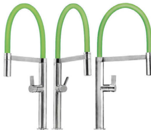
Ruvati Ibiza faucet

Ruvati brings a colorful vision to the kitchen with its Ibiza faucet, complete with brilliant silicone sleeves. Eye-catching on its own with a