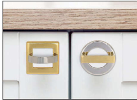
Atlas Homewares Tableau Collection

The new Tableau Collection by Atlas Homewares is inspired by a modernist take on classic geometry. It allows end users to truly unleash their creativity. The pieces come unassembled with shapes and finishes that can be mixed and matched to suit any décor or