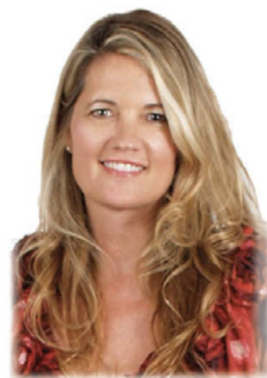
BY LINDA JENNINGS Kitchen & bath specialist

with its extraordinary crystal doorknobs and heirloom-quality hardware. Available in brilliant shades of emerald green, cobalt, pink and black, these authentic crystal knobs add a bit of spar-