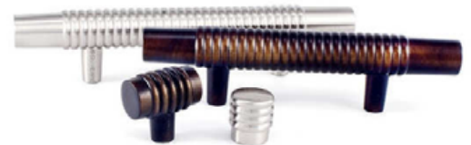
DuVerre Stacked Collection

DuVerre blurs the line between form and function with its new Stacked Collection of cabinet hardware. Created as an original work by renowned Irish designer Clodagh, Stacked is crafted from eco-friendly recycled aluminum