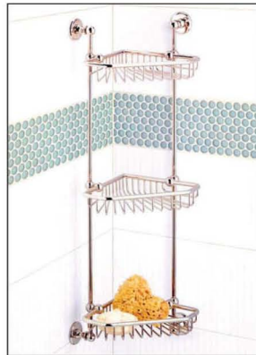
Sterlicham Co. Ltd.

The new Three Tier Corner Basket from Sterlicham Co.