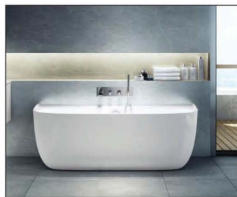
Victoria + Albert

exterior color finishes and may be installed with or without an overflow. As with all Victoria + Albert baths, it is crafted from its signature ENGLISHCAST material and hand-finished to a glossy shine.