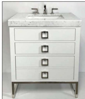
The Furniture Guild

There's something so glamorous and posh about enhancing your décor with the gleam of crystals. Ruvati got it just right with its new Valencia Collection of bath accessories — a hint of glitz to add the perfect amount