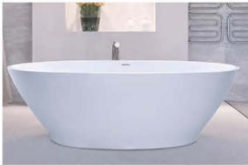
MTI Baths Alissa model 231

Making spaces seem larger than they are is always a good thing, whether that is achieved through smart engineering or with visual elements that create an illusion of roominess. MTI Baths succeeds on both counts with their redesigned Alissa freestanding tub. Offered in response to frequent requests for a tub that will fit in a 66-inch alcove, this beautiful oval bath is notable for its integral pedestal and sleek lines. The Alissa measures a compact 64-5/8-inch long x 33-1/2-inch wide, yet with MTI's single-wall SculptureStone construction, the bathing well is surprisingly spacious. Offered in white or biscuit, matte or gloss finish, the tub can be ordered as a soaking tub or as a therapeutic air bath. www.mtibaths.com