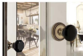
Grandeur Hardware Lyon and Coventry Knobs