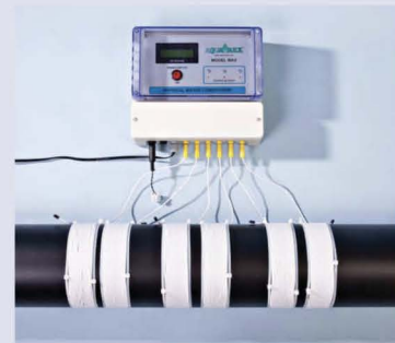
Aqua-Rex WK5 suitable for pipe sizes up to 6 inches.