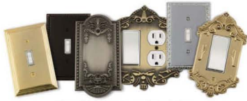
Nostalgic Warehouse Switchplates

configurations, including toggle and rocker switches and duplex outlet covers. www.nostalgicwarehouse.com