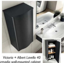
Victoria + Albert Lavello 40 Armadio wall-mounted cabinet

Victoria + Albert offers a smart solution for bathrooms with limited storage in the form of an elegant wall-mounted cabinet ideal for neatly storing away linens, shampoos, and lotions. Known as the Lavello 40 Armadio, this oh-so-practical cabinet is crafted from the finest beech timbers and features two adjustable shelves. Install a single cabinet for extra storage or pair them on either