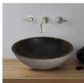
Lenova Black Granite Bath Sinks

You might think of soft pastels as the traditional colors of spring, but this year's color trend is all about bold color blocking patterns, and the leading color is black. Designers are moving away from white-on-white bathrooms in favor of a look that is more high-contrast. Black is a particularly sophisticated choice in the bathroom, and Lenova strikes just the right note with their fabulous black granite sinks. Available as an above counter round bowl or a rectangular sink paired with a chic stainless-steel stand; both options are visually stunning. The sinks are created from a solid block of