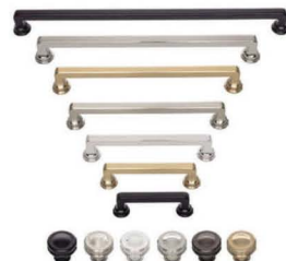
Atlas Homewares Oskar Collection

thoughtful touches such as a Silent-Close quick-release seat and cover and a choice of five beautiful metal finishes on the tank lever and hardware. www.icerausa.com