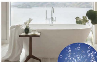
MTI Baths MicroBubbles

MicroBubbles use the powers of tiny bubbles to gently cleanse and exfoliate the skin. This innovative technology saturates the water with 50 percent more dissolved oxygen than regular water; turning the bath water a milky white and creating a relaxing soak. As millions of tiny bubbles pop, they release energy that helps to keep the bath water hot and the bather's body temperature warm. The oxygenated water gently polishes the skin and removes impurities from pores,