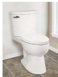
ICERA Palermo II Toilet

Less is more when it comes to smart bathroom design. A minimalist space is easier to maintain and creates a serenity that is soothing to the body and spirit. ICERA's updated Palermo II toilet has a sleek, understated style that is modern and sophisticated. Its two-piece design features a compact-elongated bowl and is fully skirted for a contemporary silhouette. Crafted of vitreous china, the Palermo II offers a high-efficiency design with a gravity-fed flushing system that requires just 1.28 gallons per flush. This exceptional toilet is ADA compliant with