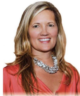
BY LINDA JENNINGS Kitchen & bath specialist

thoughtful touches such as a Silent-Close quick-release seat and cover and a choice of five beautiful metal finishes on the tank lever and hardware. www.icerausa.com