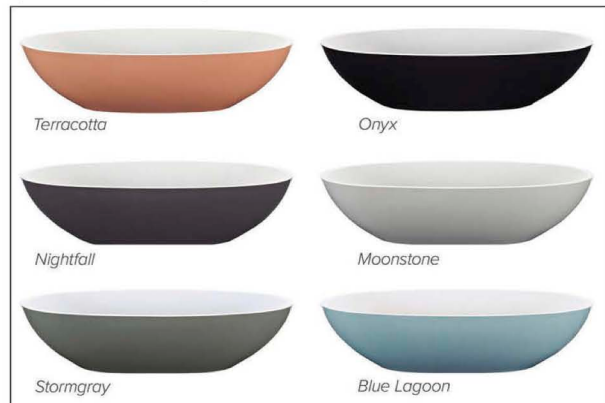
MTI Baths organic hues

Nothing adds style to a space like an unexpected splash of color. MTI Baths greatly expands the color palette in the bathroom with six new organic hues inspired by the earth, sea and sky. This