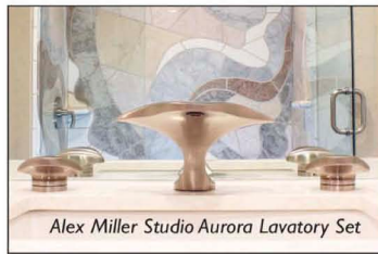
Alex Miller Studio Aurora Lavatory Set

For those inspired by nature, the new Aurora Collection from Alex Miller Studio will speak to you. As the first in a new series