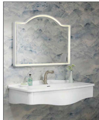
Victoria + Albert gloss white vanities

amples listed here, it's easy to see the idea of adding drama is a trend that's here to stay. People like to make a statement without spending a fortune. As leaders in the kitchen and bath trade have discovered, the key is thoughtfully designed products that offer something extra. It's about taking the luxuries and making them work.