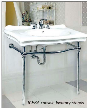
ICERA console lavatory stands