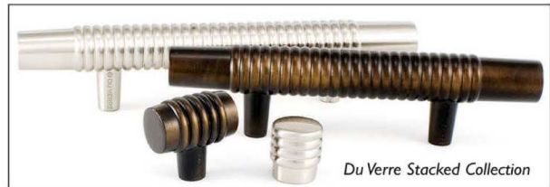
Du Verre Stacked Collection

Step outside the ordinary with Stacked cabinet hard-