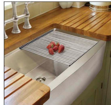
Lenova PermaClean Apron Front Prep Sink

Crafted from durable commercial-grade 304 stainless steel, the PermaClean Apron Front Ledge