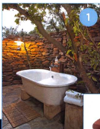
1. A Victoria + Albert bath is placed in an outdoor wellness setting at Hotel Faru Faru Lodge in Tanzania, Africa.