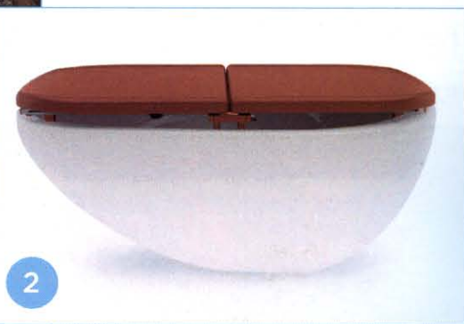
2. BainUltra's Universal Massage Table on the Essencia Bathtub. 3. Essencia Wellness Tub by BainUltra.