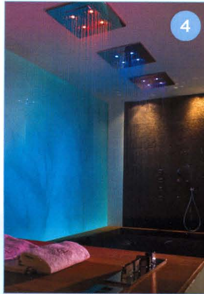
4. Minimal showers with Chromatherapy from the Gessi "Private Wellness" Collection.

As Liao mused, "I have to wonder if the growing popularity of high-tech toilets and bidets isn't part of the wellness spa trend. It's almost as if the toilet is the last frontier." ●