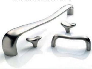
Du Verre Hardware Botero collection