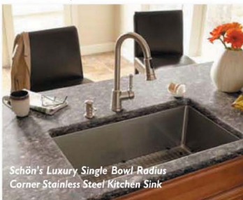
Schön's Luxury Single Bowl Radius Corner Stainless Steel Kitchen Sink

Crystal Collection provides a true luxe look with a sparkling array of knobs and pulls.