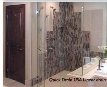
Quick Drain USA Linear drain