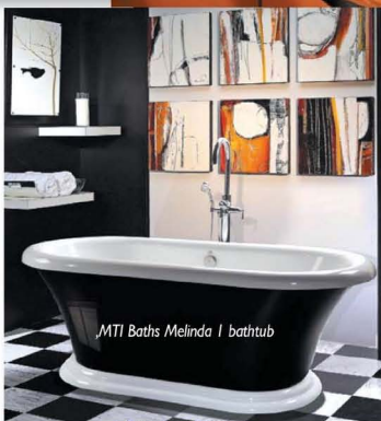
MTI Baths Melinda I bathtub

Great choices as accent colors, black and white are gaining popularity in hardware options too. Atlas Homewares offers several collections in a range of styles, all available in a black finish. The simple silhouette of its Low Arch Pulls is given greater impact when done in black. The Buckle Up Collection with its bold lines and clever clips seems especially chic in black. And for those who love the elegance of crystal and black, the jewel-like Legacy