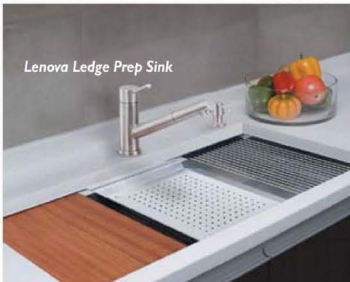
Lenova Ledge Prep Sink

In today's busy world, people appreciate products that serve their purpose efficiently yet still manage to look good. A perfect example is the Ledge Prep Sink