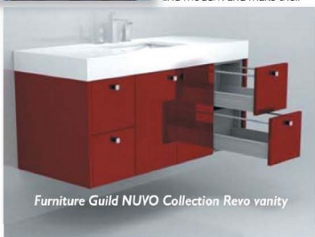
Furniture Guild NUVO Collection Revo vanity

Black and white are bold and modern and make their