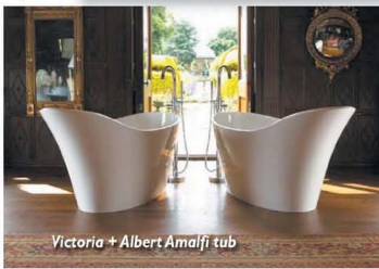
Victoria + Albert Amalfi tub