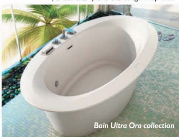
Bain Ultra Ora collection