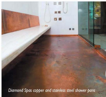
Diamond Spas copper and stainless steel shower pans

As showers get larger, one emerging trend is to remove the shower door or wall entirely, creating a European-style open bathroom or wet room. Linear drains from Quick Drain USA are ideal in this scenario. Not only are they simple to install in a variety of configurations, they also create a curb-less shower, which meets Universal Design and ADA requirements.