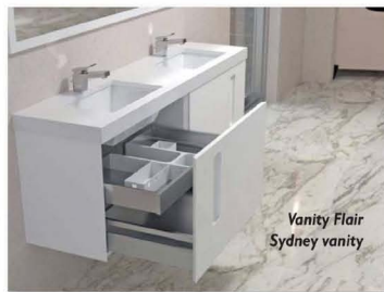
Vanity Flair Sydney vanity