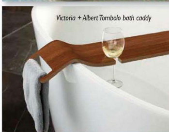
Victoria + Albert Tombolo bath caddy