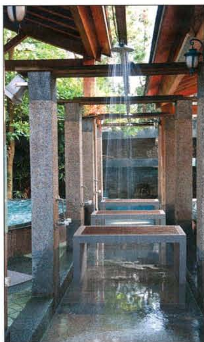
Stylish MTI Boutique bench

Atlas Homewares amps up the masculine look with its Hampton collection of knobs and pulls. Wrapped in rich leather, this