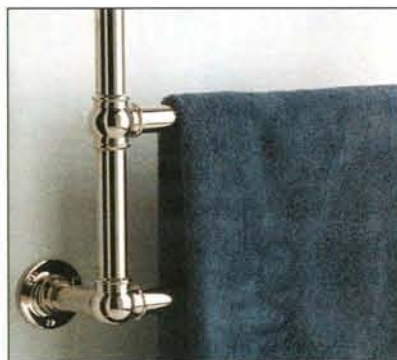
Sterlingham towel warmer made of high quality brass

Sterlingham Co. Ltd. offers an exceptional line of handcrafted low-energy towel warmers that are the perfect addition to any bathroom. Made of high quality brass, they come in a range of styles, from English Edwardian to Art Deco to modern traditional, with custom sizes, finishes and details all available. These towel