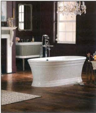
V+A Worcester with vintage stonework, ribbed plinth & rim

Victoria + Albert finds a gently curved balance between classic and contemporary with its Worcester tub. Named for an ancient English cathedral, this tub pays homage to vintage stonework with a classically ribbed plinth and rim. Its curved sides