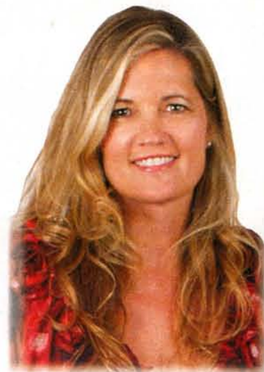
BY LINDA JENNINGS Kitchen & bath specialist

Industrial style adds eclectic fun into a space, especially through the use of unfinished surfaces, exposed architecture and non-traditional materials. Mega Pulls from Atlas Homewares are an