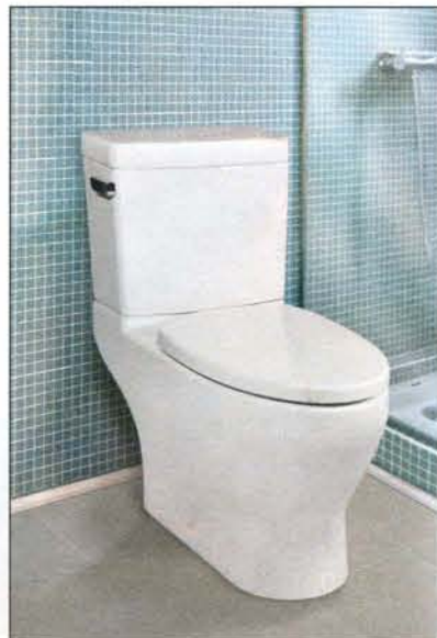
ICERA Cadence II with updated seat and design

Modern, minimalist design is trending right now. Case in point - the new Cadence II toilet from ICERA. This latest design masterpiece features a fully skirted streamlined look that brings a