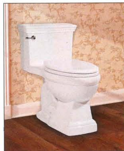
STC Presley II uses 1.28 gpf

most common bacteria on food and hands; it removes agricultural residue on produce, and it leaves behind no chemical residue of its own, thereby reducing your rinsing time. The Ozone collection includes six styles of faucets and is available in a brushed nickel or polished chrome finish.