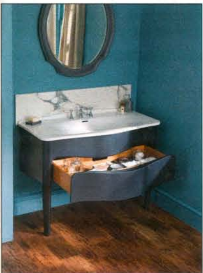
V+A Mandello + Sestri has a uniquely shaped basin