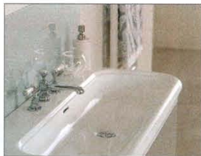
V+A Lario 100 features a Victorian-era ribbed skirt

a bathroom furniture line that covers a wide range of styles. Included in the collection are two beautiful integrated vanity units designed exclusively by Italian design studio Meneghello Paoletti Associati. The Mandello 114 has a uniquely shaped basin that evokes a water drop as it touches the surface, while the Lario 100 features a Victoria-era ribbed skirt and a minimalist middle vanity drawer. Both are stunning and