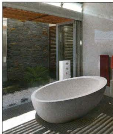
MTI Baths Cascara tub resembles a cocoon

MTI also translates curves into their new Cascara tub that resem-