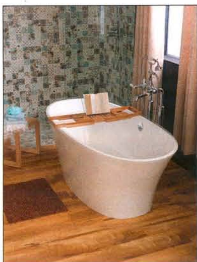
V+A Ionian tub for long soaks and compact spaces

Adding sophisticated style to a small bathroom may seem like a challenge, but Victoria + Albert has made it easy with their new Ionian tub. The perfect design centerpiece for smaller spaces, the Ionian has a compact footprint that consumes little floor space,