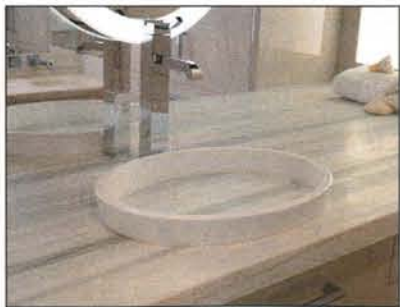
MTI Continuum creates optical illusion of design

There's something elegant about a curve - so graceful and refined. Today's designers are embracing the simplicity of curves in innovative ways. I particularly love the Continuum Sink from MTI Baths. Created in partnership with kitchen and bath designer Matthew Quinn, this recessed construction uses the countertop cutout to form the bottom of the sink with just 2 inches of the