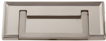
L-Bracket Drop Pulls