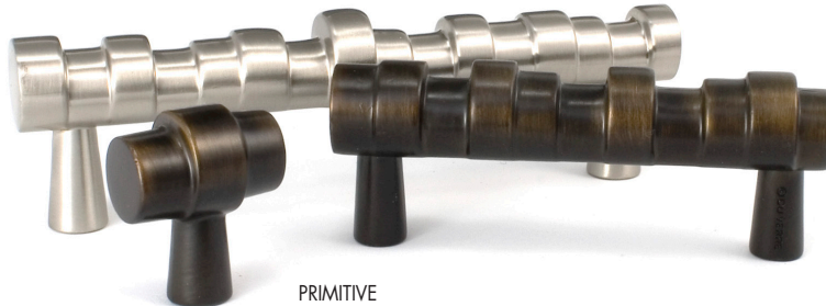
PRIMITIVE by Clodagh