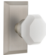
Studio Short Plate in Satin Nickel