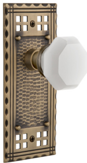
Craftsman Long Plate in Antique Brass