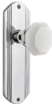
Deco Long Plate in Bright Chrome