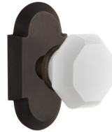
Cottage Short Plate in Oil-Rubbed Bronze