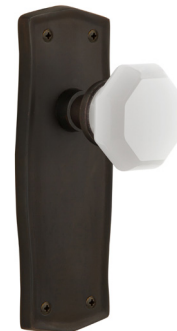
Prairie Long Plate in Oil-Rubbed Bronze