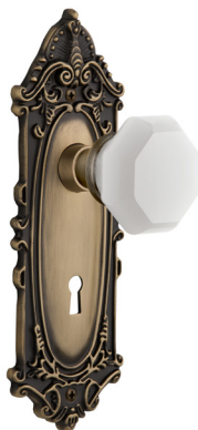
Victorian Long Plate in Antique Brass