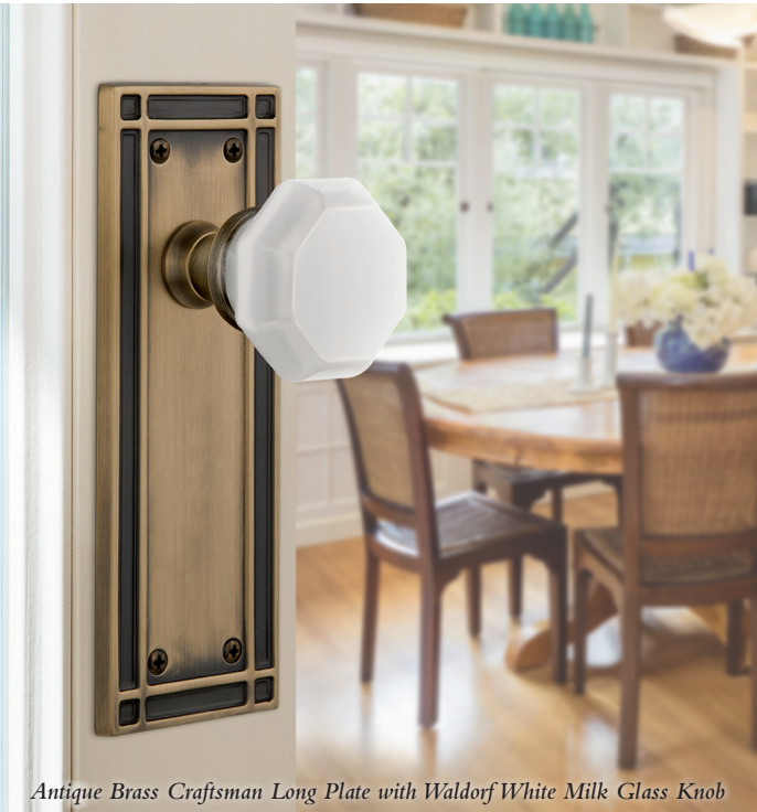
Antique Brass Craftsman Long Plate with Waldorf White Milk Glass Knob