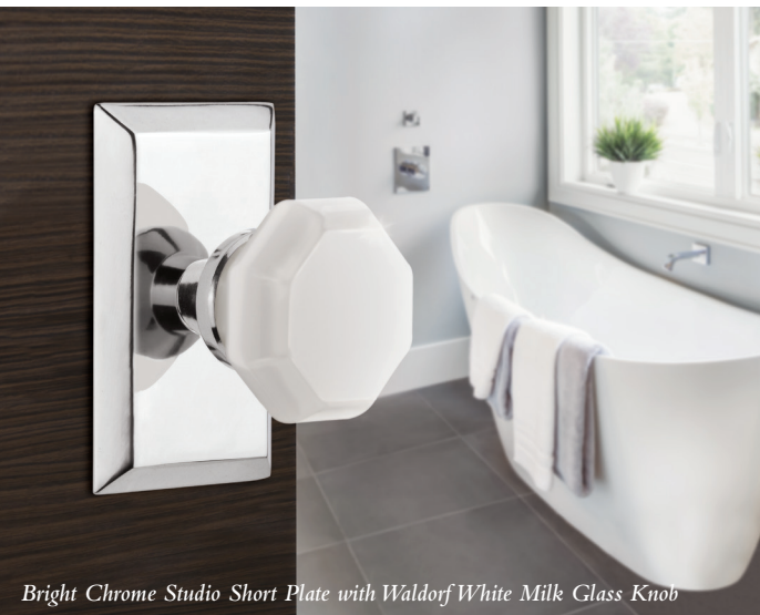
Bright Chrome Studio Short Plate with Waldorf White Milk Glass Knob

Founded in 1980 by an antique store owner, Nostalgic Warehouse has grown from a modest proprietorship to a flourishing company. Known for its elegant styles and exceptional craftsmanship, the company is revered by restoration contractors, antique dealers, homeowners, designers, builders and architects who appreciate the uncommon beauty and quality of its product line. Unlike competitors who rely on a cheaper cast or stamped brass, Nostalgic Warehouse uses only hot-forged brass for a solid, durable construction that can accurately display the intricacies of vintage design. Their brass knobs are completely recyclable, and their crystal knobs are made of real, lead crystal, not glass. In keeping with the brand’s vintage roots, they offer customers the option of using historically accurate mortise locks. Nostalgic Warehouse products are designed to last a lifetime.