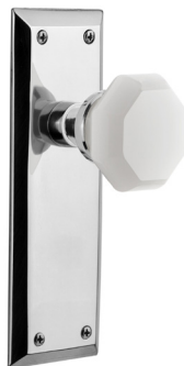
New York Long Plate in Bright Chrome