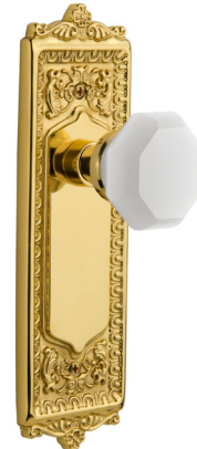
Egg & Dart Long Plate in Polished Brass