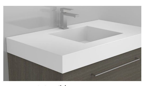
4 inch guildstone countersink