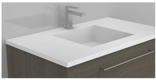
1 inch guildstone countersink