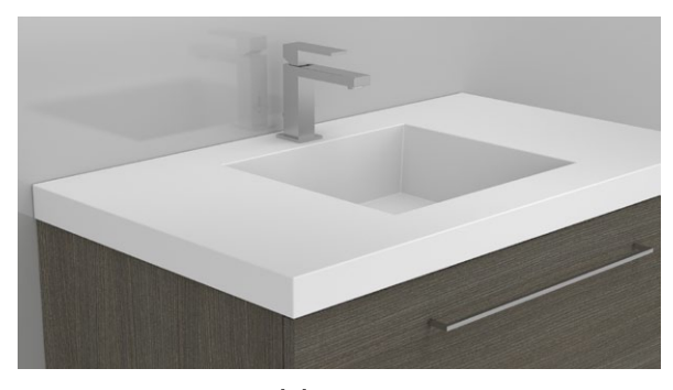
2 inch guildstone countersink