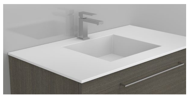
1/2 inch guildstone countersink